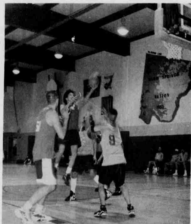
Action between Nez Perce and Oregon Athletics.