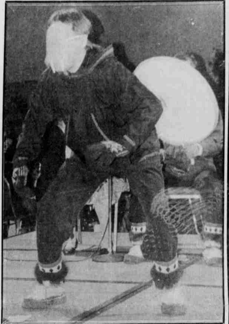
Inuit dancer performed the Walrus Dance for hundreds of spectators November 2.

Oregon Indian tribes generously thanked Hatfield for his many years of seemingly endless support for Indian tribes and the numerous obstacles facing them throughout the years.