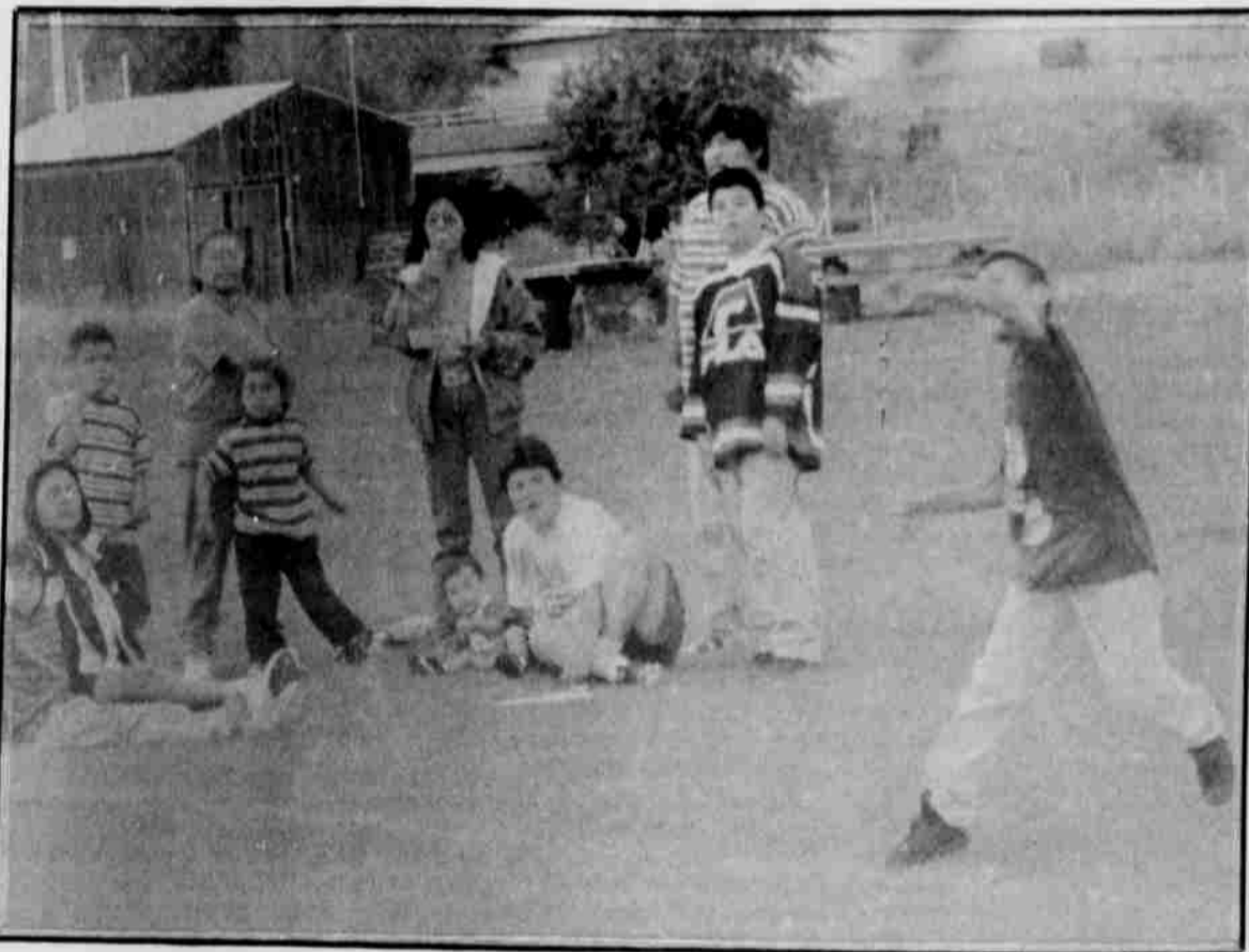
Participant passes a football during Punt, Pass and Kick competition.