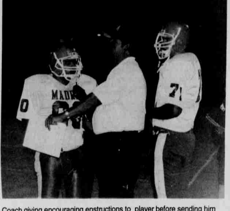
Coach giving encouraging enstructions to player before sending him in the game for the next play. The action was wild in the non-league and opener for both teams