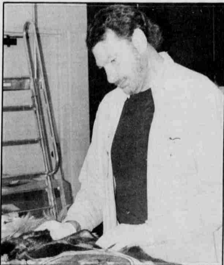
Museum guest looks at pieces in the private artifact collection.