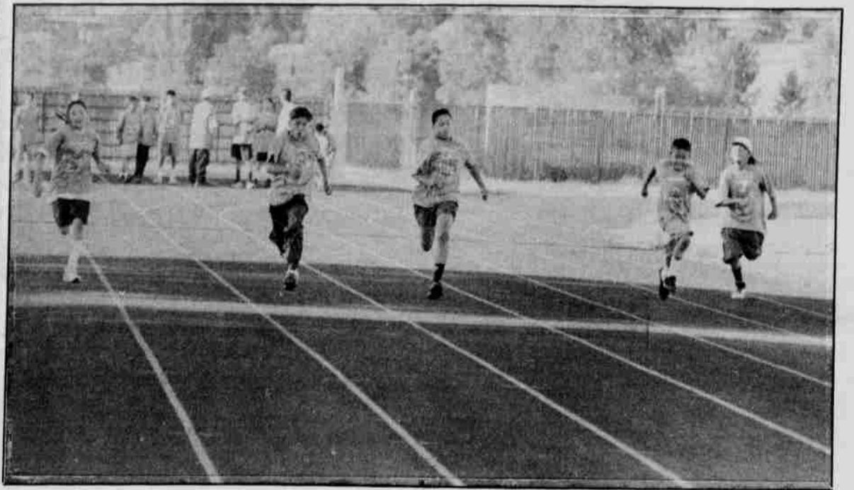
Youth running the 100 yd dash at Mills track meet.