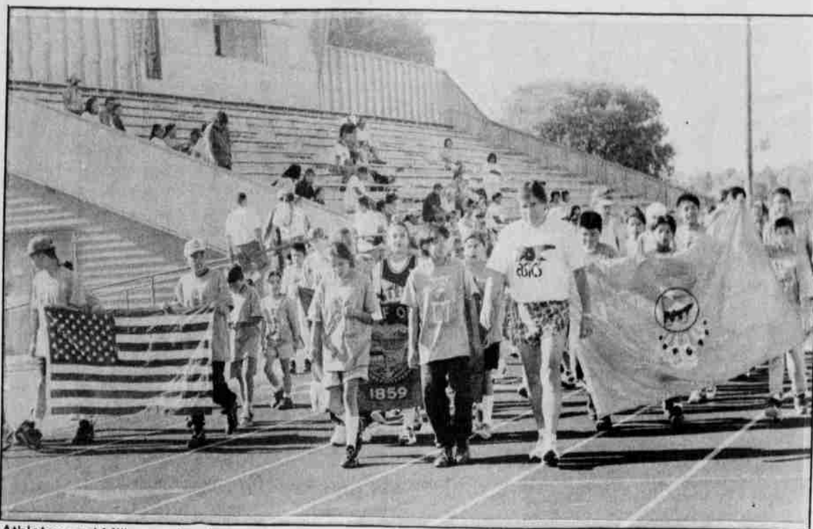
Athletes and Mills marched around the track before meet started.