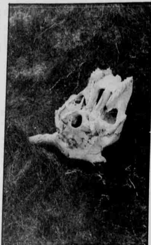
A cow skull was charred white.