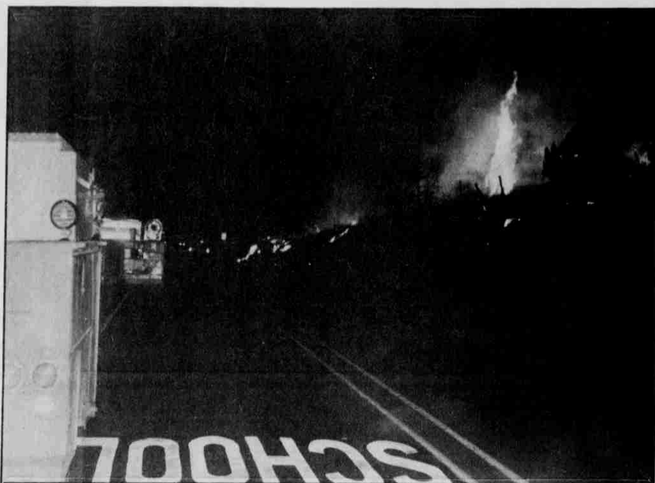
The blaze burned furiously between the Catholic Church and residences on Miller Heights.