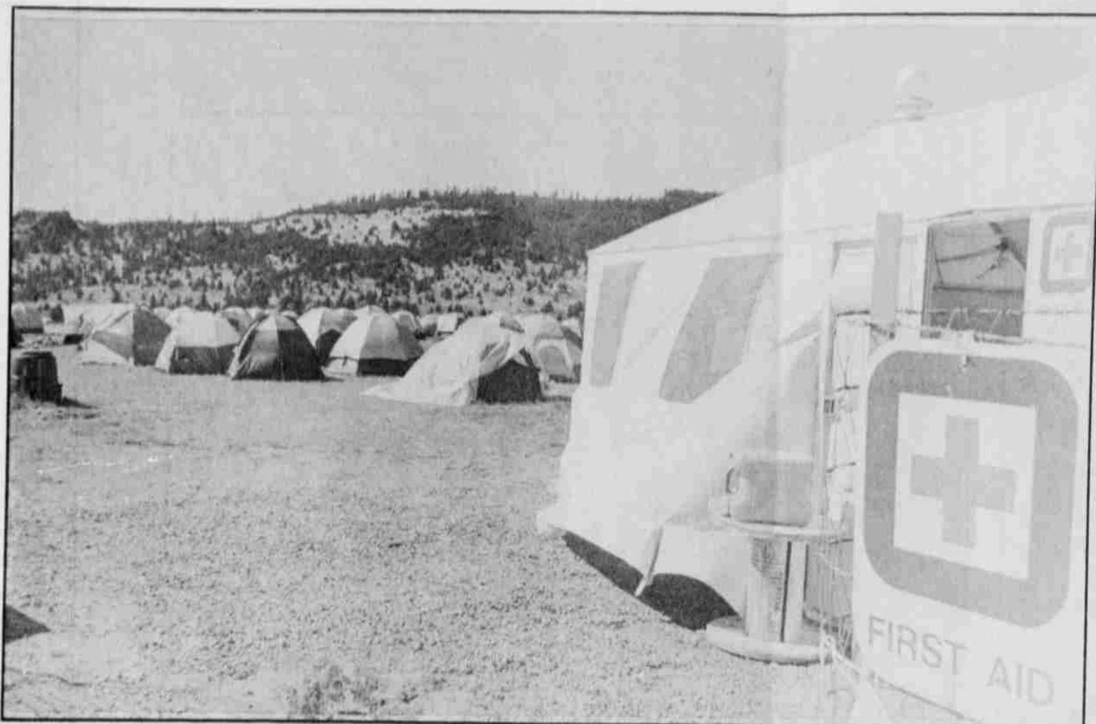
A first aid station provides immediate care for injured individuals and is an essential part of fire camp.