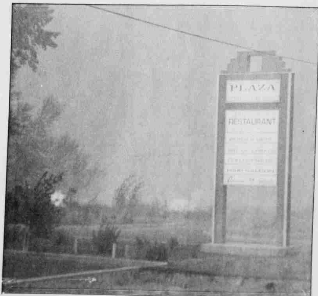
Fire crews were successful in protecting the homes on Walsey Lane and the Warm Springs Plaza.