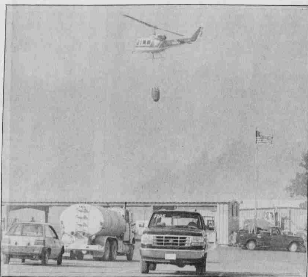
A helicopter flies low over the Industrial Park on its way to retrieve water from a portable tank.