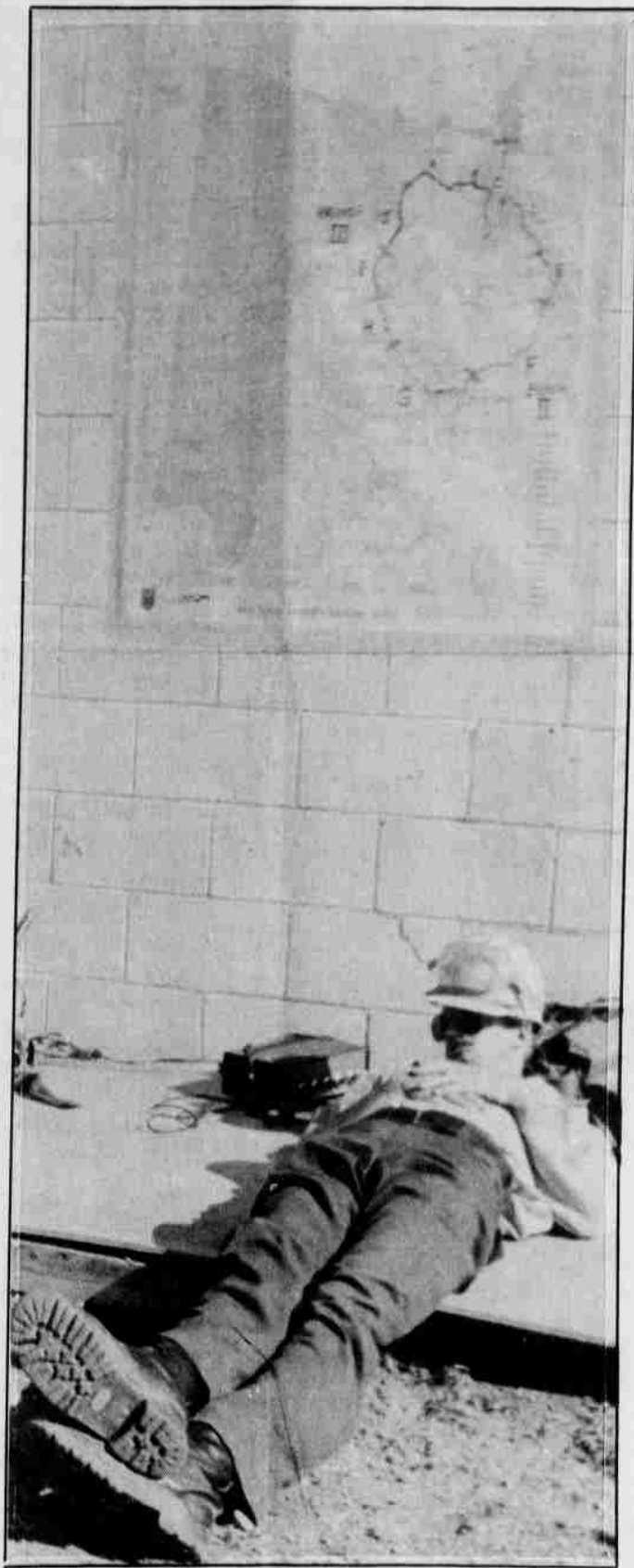
Weary firefighters catch a rest whenever and wherever they can.