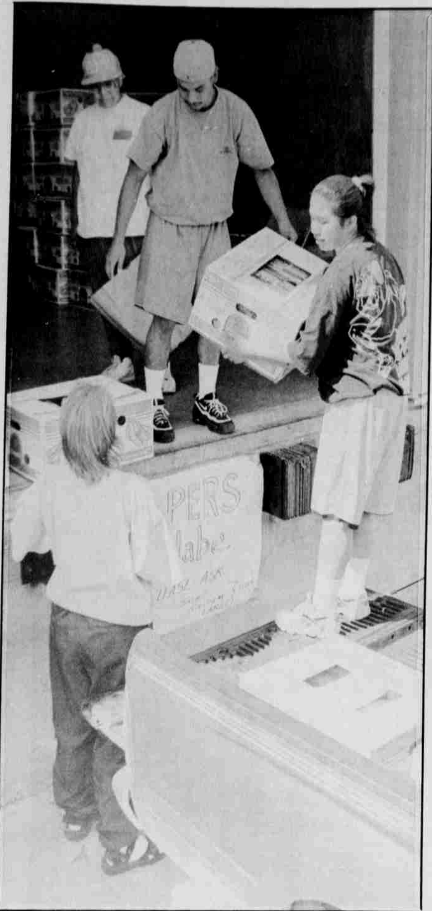
Frontier Missions of Portland distributed 1,100 boxes of dry and canned goods to fire victims in Warm Springs Thursday. Grocery items were donated by food stores in the Portland area.