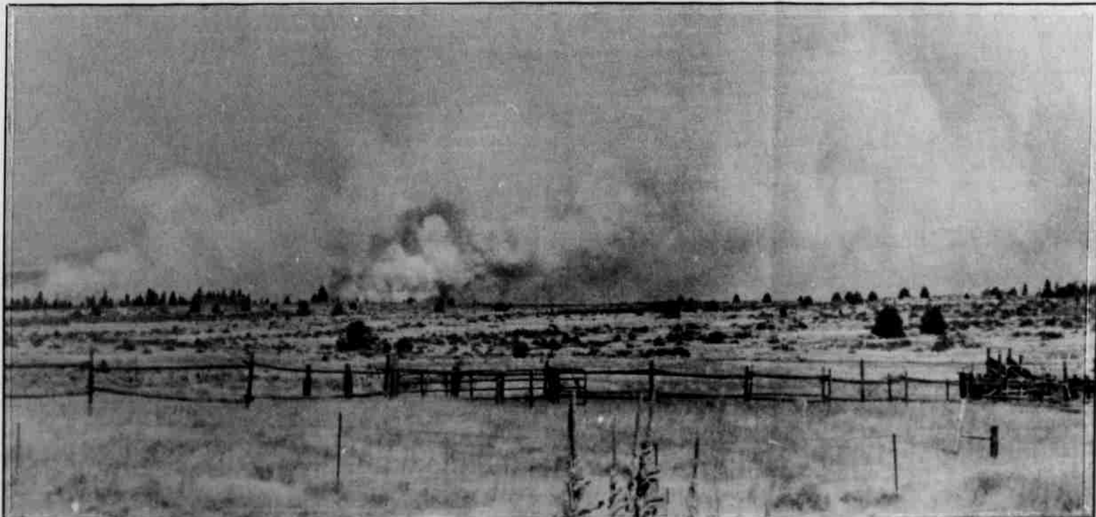
Smoke was rolling out of Mill Creek Canyon Thursday evening.