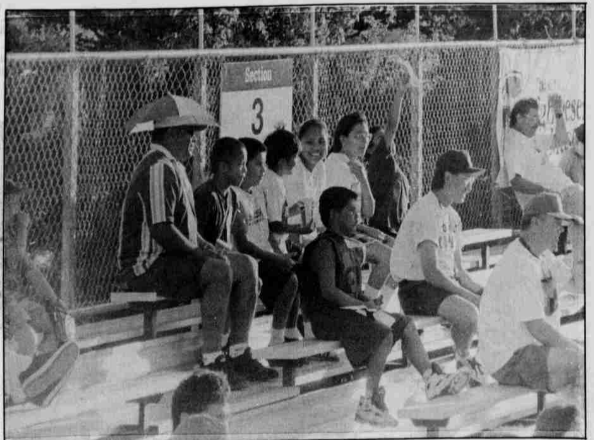
Summer Rec took twenty-three to the Bend Bandits Game