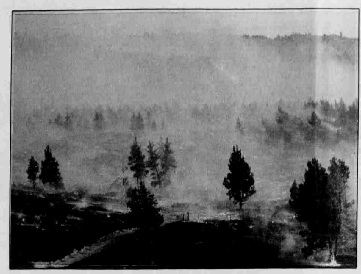
The Kuckup Fire burned quickly toward the southern end of the reservation.

Fire officials urge all residents to use caution when outdoors.