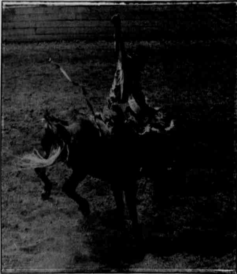
Saddle bronc rider gives it his all during Pi-Ume-Sha rodeo.