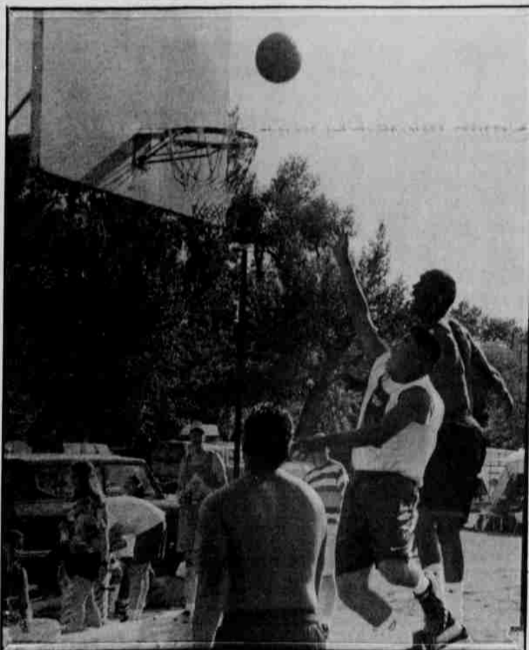
Seven teams competed in the Tar-Stars second annual 3 on 3 basketball tournament.