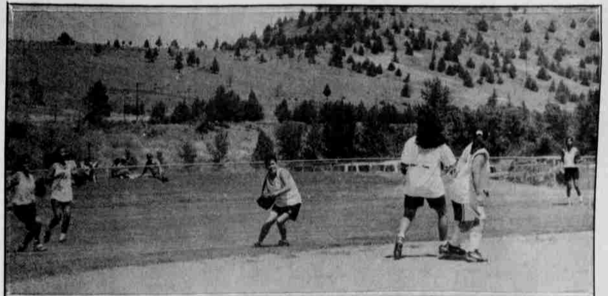
The Bravettes and Hoopa test their softball skills during championship game. Hoopa won the tournament.