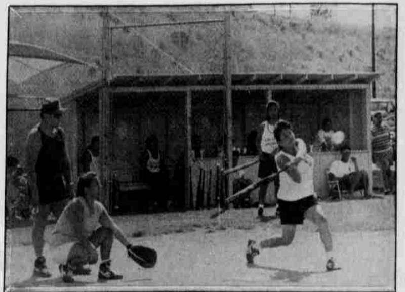
Expert batting led the Hoopa team to victory.