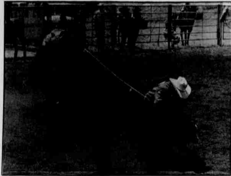
Calf roping tried the skills of all contestants.