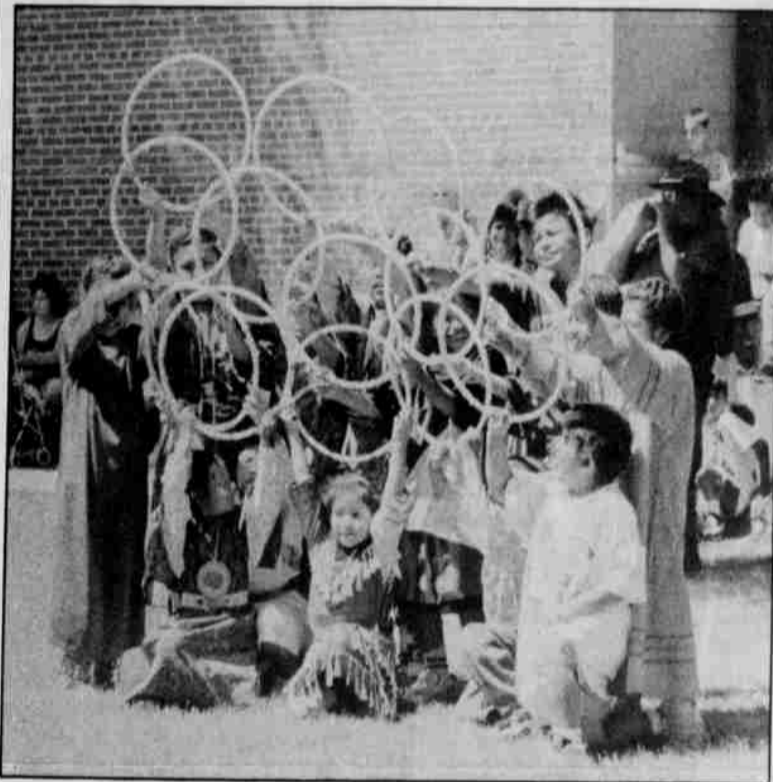
Simnasho students performed a hoop dance that they created as a group dance. Here is the flower formation.