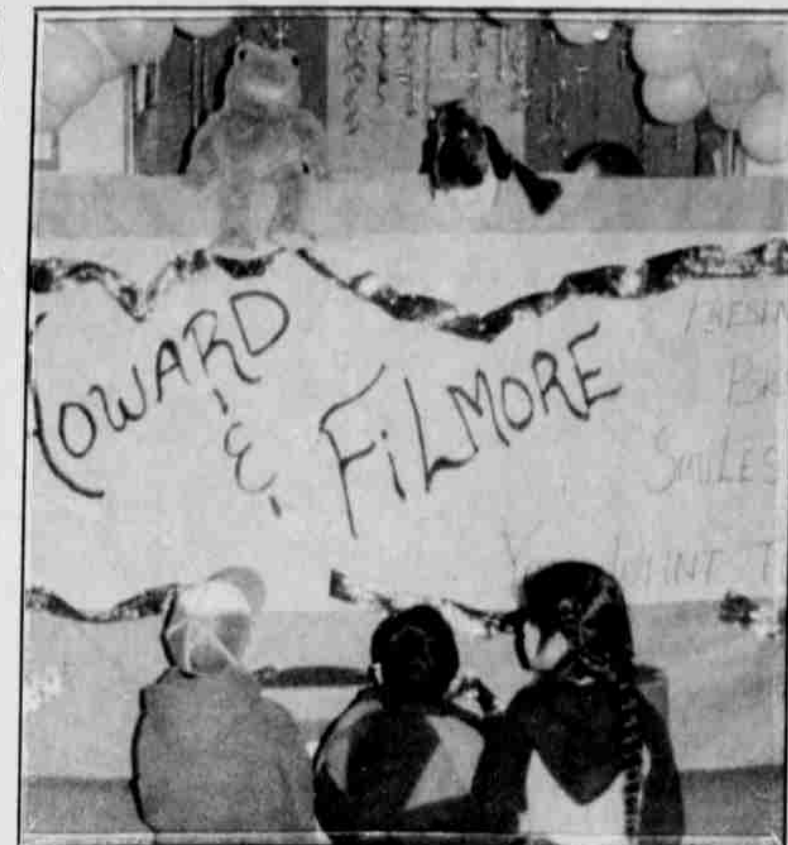
Puppet shows were presented at the Dental Clinic open house.

Another National honoring Children's Dental Health Month was a coloring contest organized by the dental clinic. This was the second year the Dudley Coloring Contest ran for grades kindergarten to fourth grade at the elementary school. The