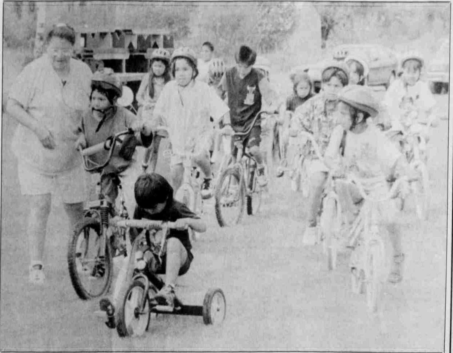
Bike parade ended the Bike Rodeo.

The bike rodeo ended with a bicycle parade.