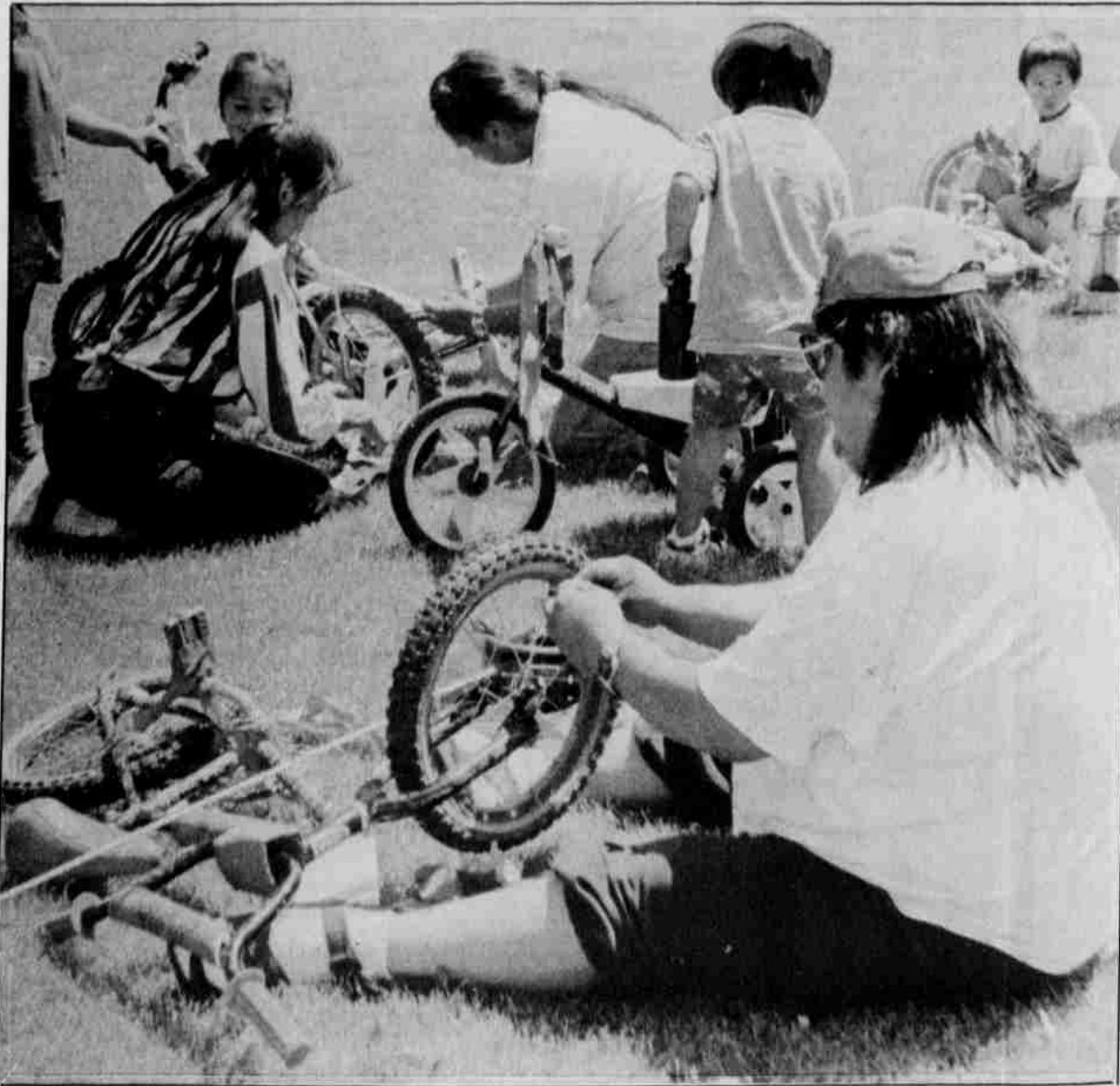
Bikes were decorated by children and their parents.