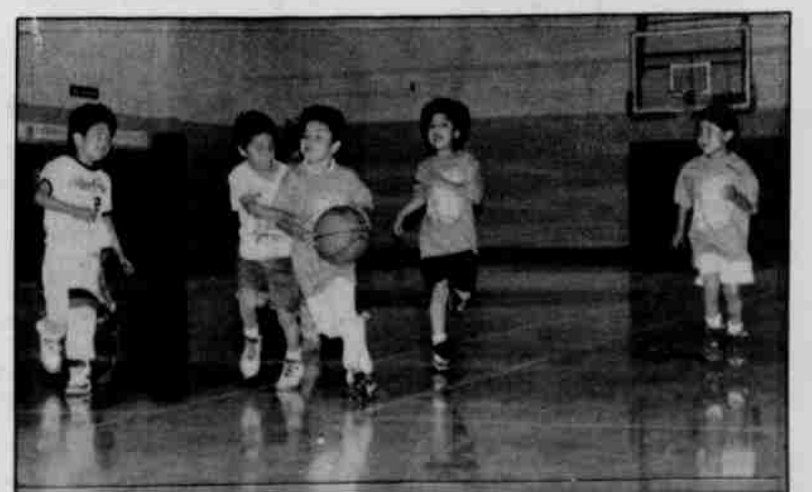
Going to the basket, 6 & under action at play-for-fun tourney May, 4-6.