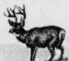
5. Daya ich'ánk. (Deer)