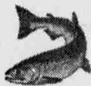
3. Daua wacúiha. (Silverside Salmon)