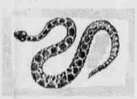
6. Daya ich'ái. (Rattlesnake)