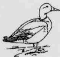
1. Daua agwíxqwix. (Duck)