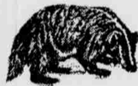
2. Daya ikawa. (Badger)