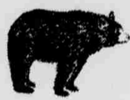
6. Daya iskintwa (Black bear)