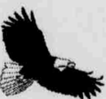
3. Daya ich'inun (Bald Eagle)