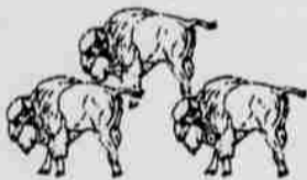
7. Daya idúihamax. (Herd of Buffalo)