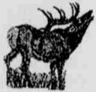
3. Daya imulak. (Elk)