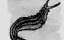
6. Daua at'ixtin (Slug)