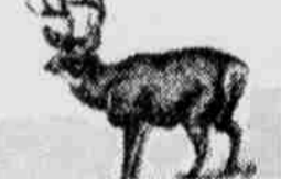
8. Daya it'álk. (Black Tailed Deer)