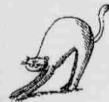
4. Daya ip'úsh. (Cat)