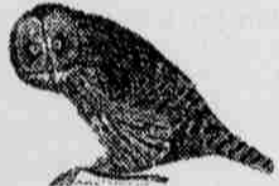
9. Daya ikauxau. (Owl)