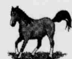
3. Daya chi ikiutan? ___N ___K'aya