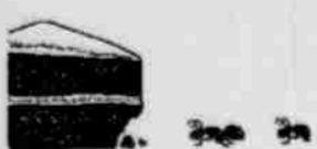
5. Daua ac'iudixax. (Ants)