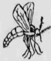
7. Daua ap'unachikchik. (Mosquito)