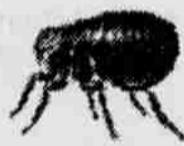
4. Daya winpu. (Flea)