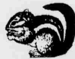
1. Daua chi aq'asnan? ___N ___K'aya

This part of our lesson will be a review of the animals. It will be a question and answer lesson "Daua chi ___?" or "Daya Chi ___" both mean "Is this a ___?" and can be answered by "N" which means yes and "K'aya" means No. (If the answer is "K'aya" then give the correct answer.)