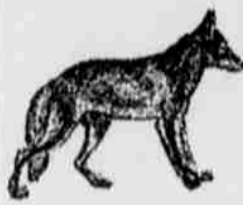
8. Daya isk'ulya. (Coyote)