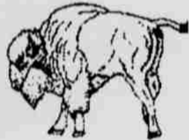
5. Daya idúiha. (Buffalo or Steer)