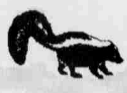
4. Daya ip'ishxash. (Skunk)