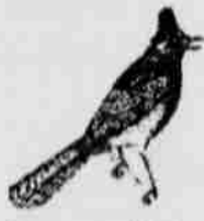
9. Daya wi'ish. (Blue Jay)