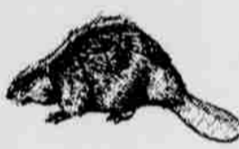
8. Daya iganuk. (Beaver)