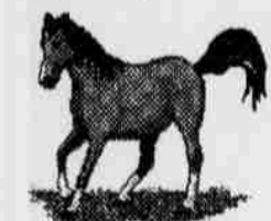
10. Daya ikiutan. (Stallion)