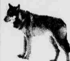
8. Daya ishgiluksh. (Wolf)