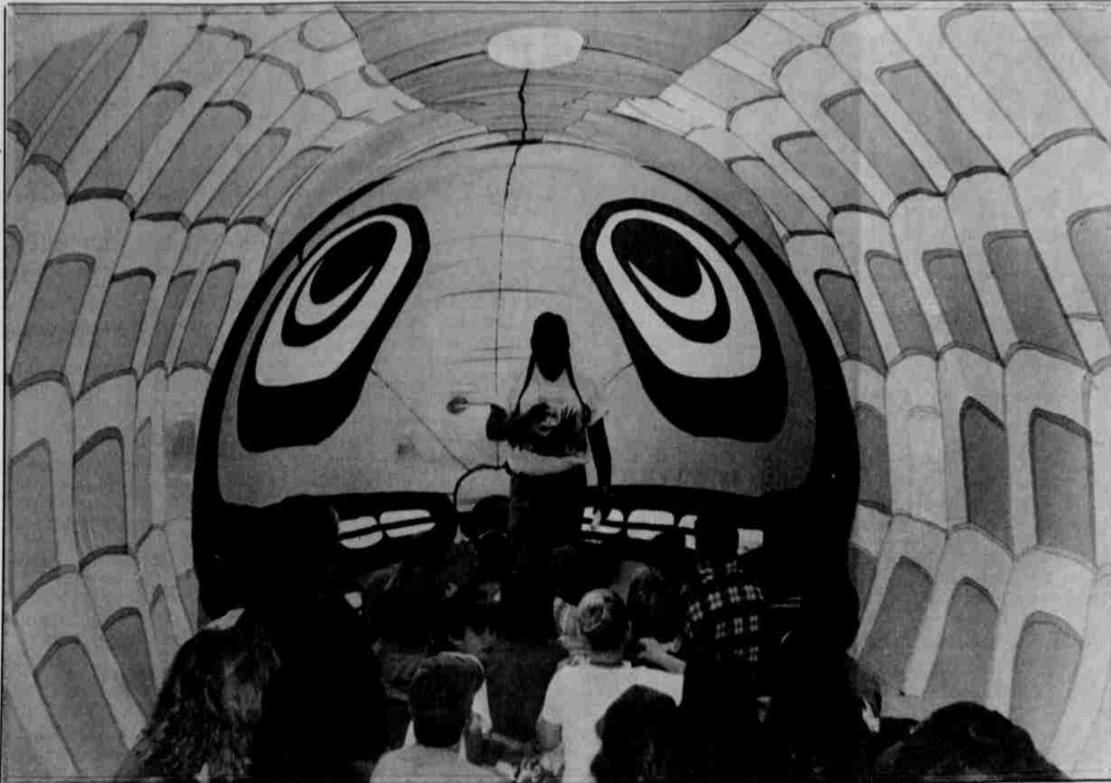
Wildfred Jim, Sr. tells fish tales in giant salmon during Seeds of Discovery Day May 14 at The Museum At Warm Springs.