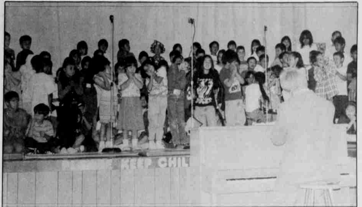
Second annual Spring Program held at Warm Springs Elementary School gym May 1.