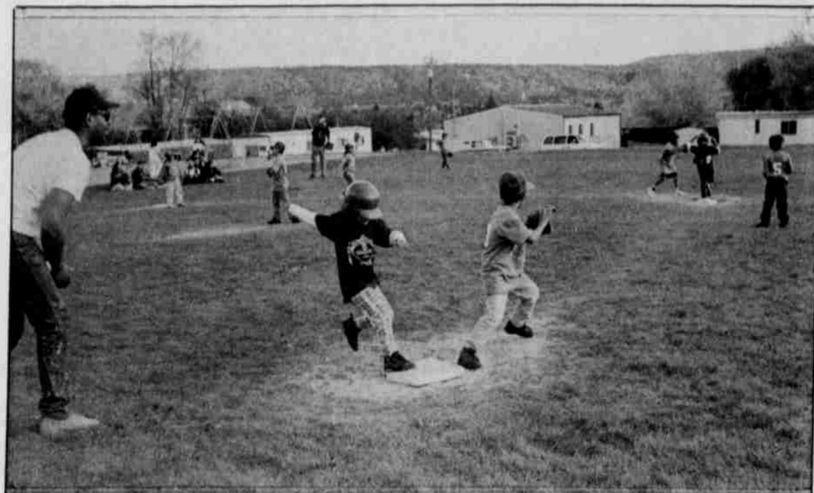
Stingers vs. Tigers