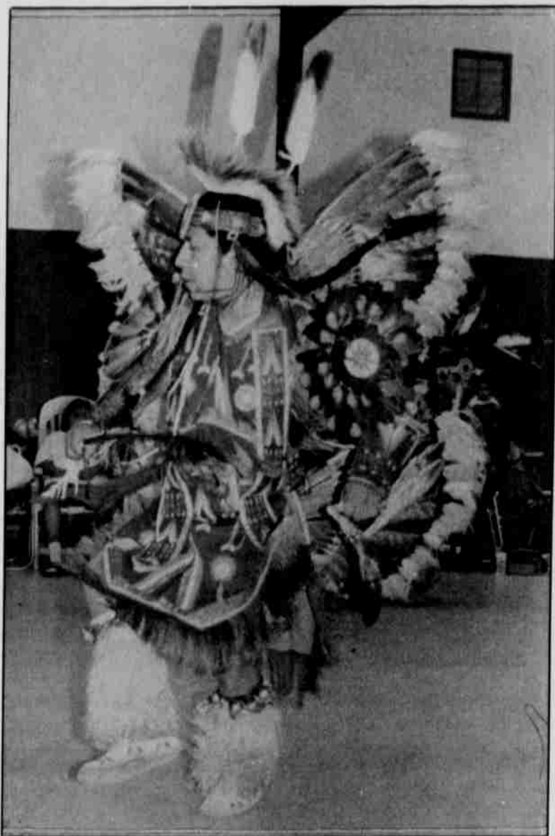
Fancy dancer at the Thanksgiving Mini Powwow.