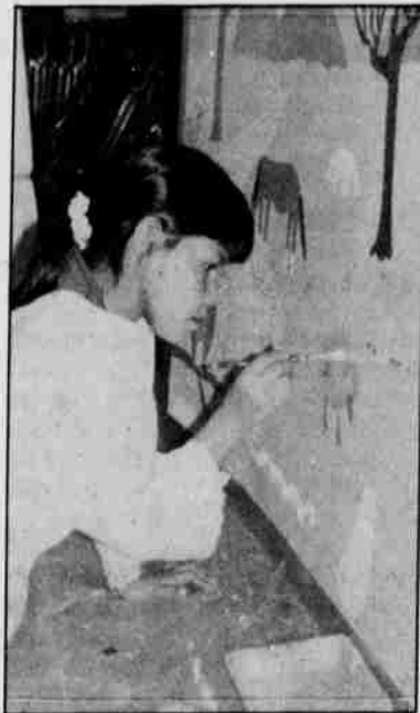
Fourth grade student paints her porcupine very carefully.