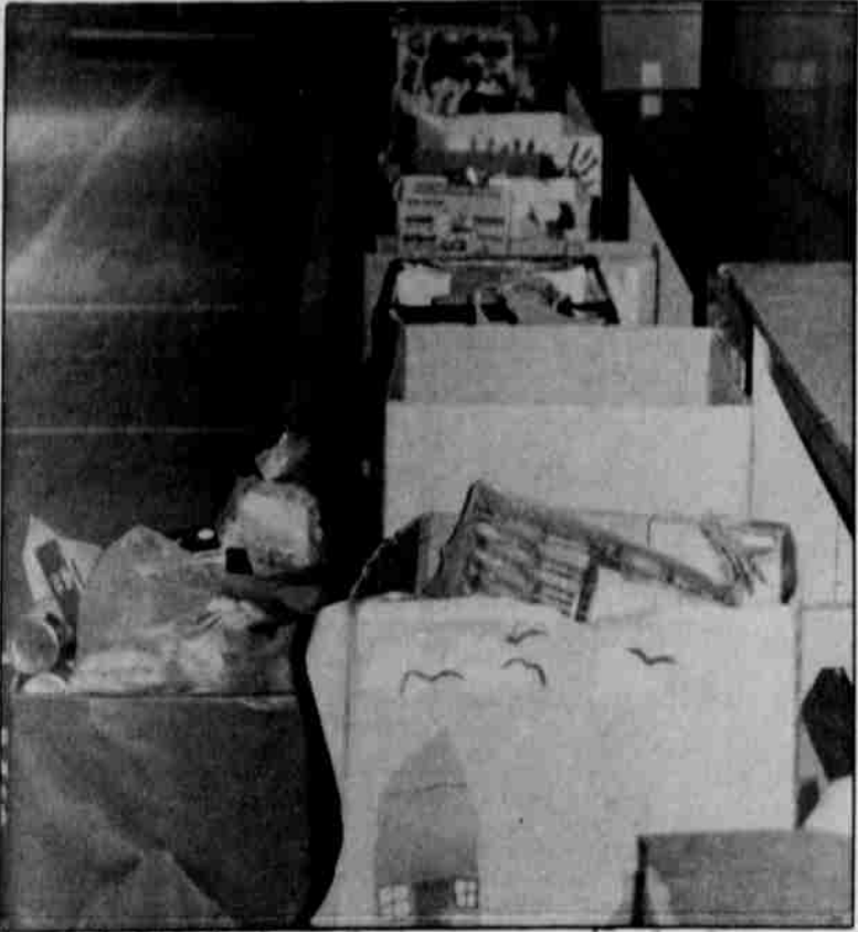
Food drive boxes were plentiful at the Warm Springs Elementary school food drive.

The Warm Springs Elementary and Early Childhood Education Center held a food drive during February to help the kids learn a sense of community sharing. The flyer stated, "The Indian people have always taken care of their own, and it is time to reclaim that tradition."