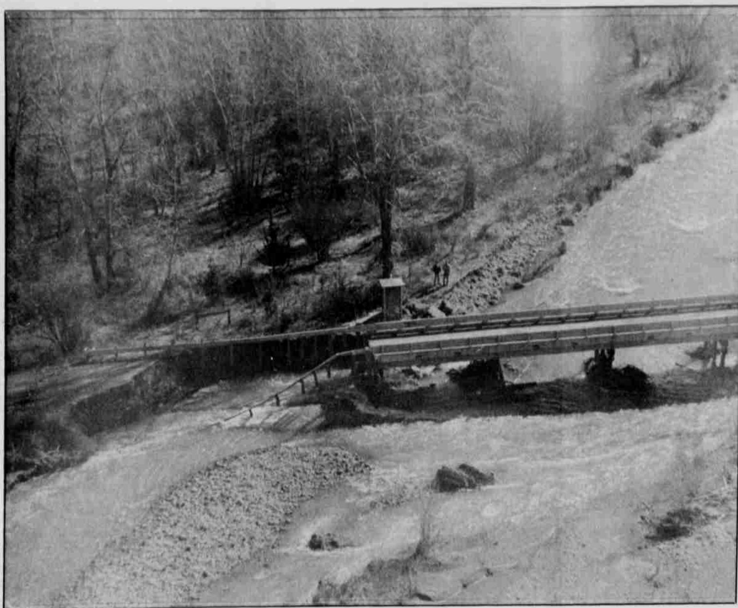
The approach to Thompson Bridge on Shitike Creek was completely destroyed.