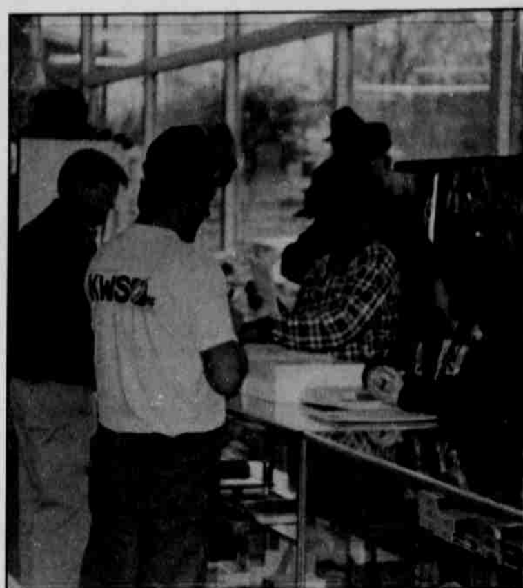
Tribal employees picked up their payroll checks at Warm Springs Market since work was cancelled for more than two days.