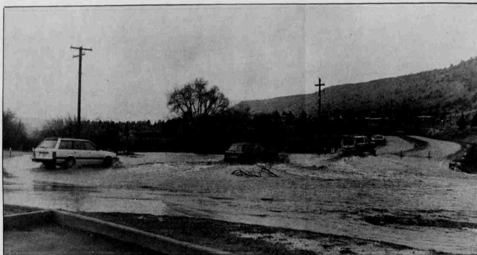
High water at the intersection of Tenino and Hollywood caused motorists to slow down.