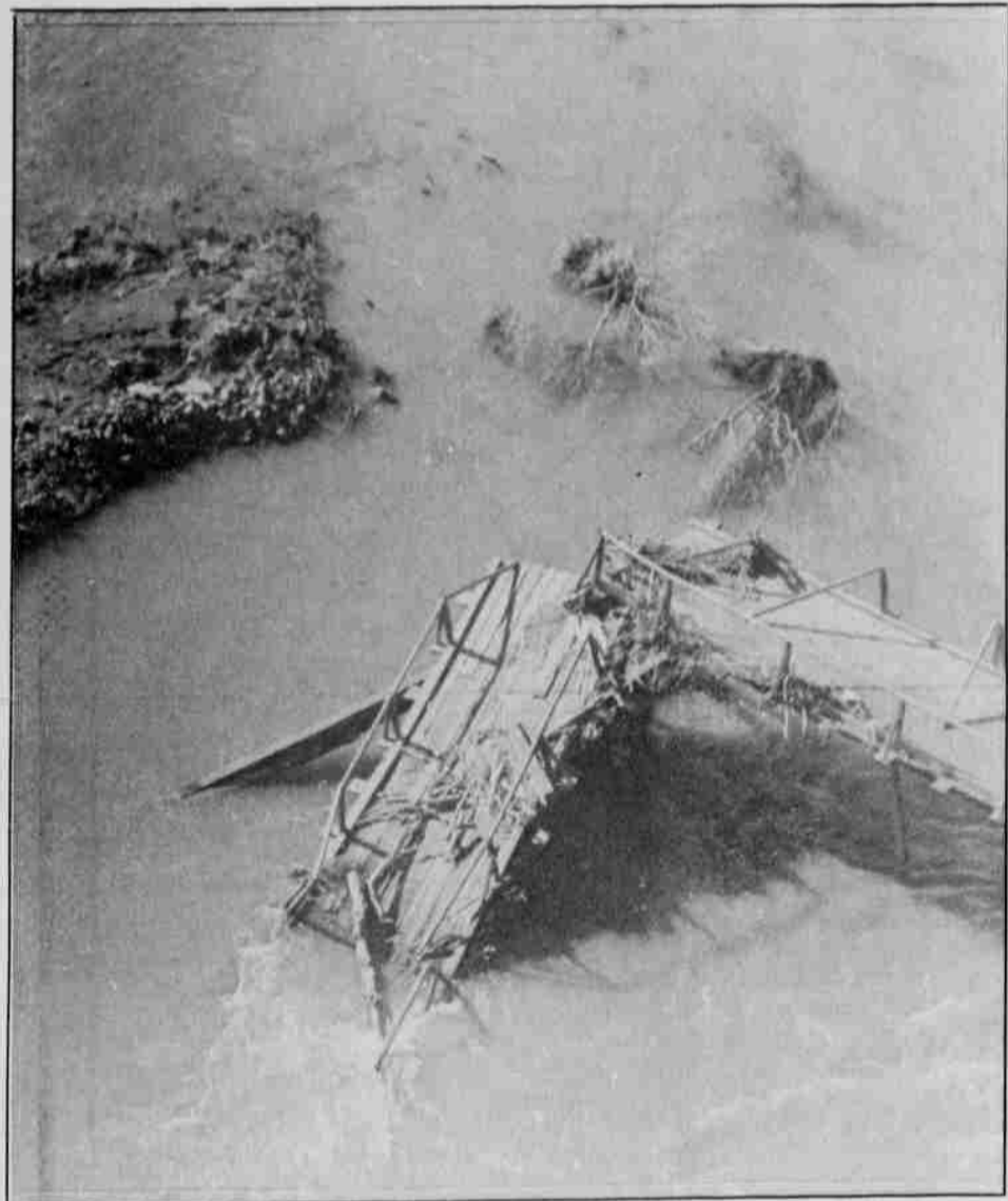
The golf course bridge was broken by the current.