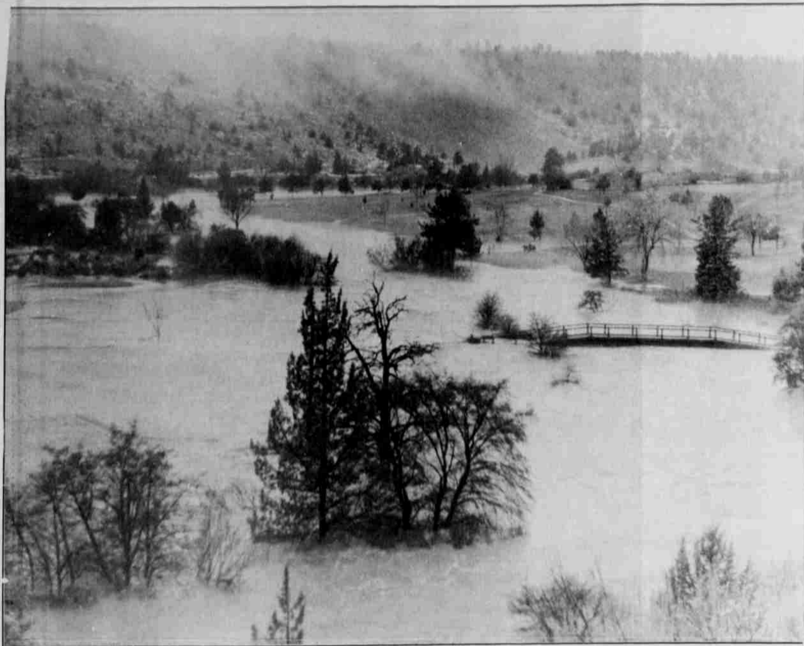
About three-quarters of the Kah-Nee-Ta Golf Course was under water during Wednesday's downpour.