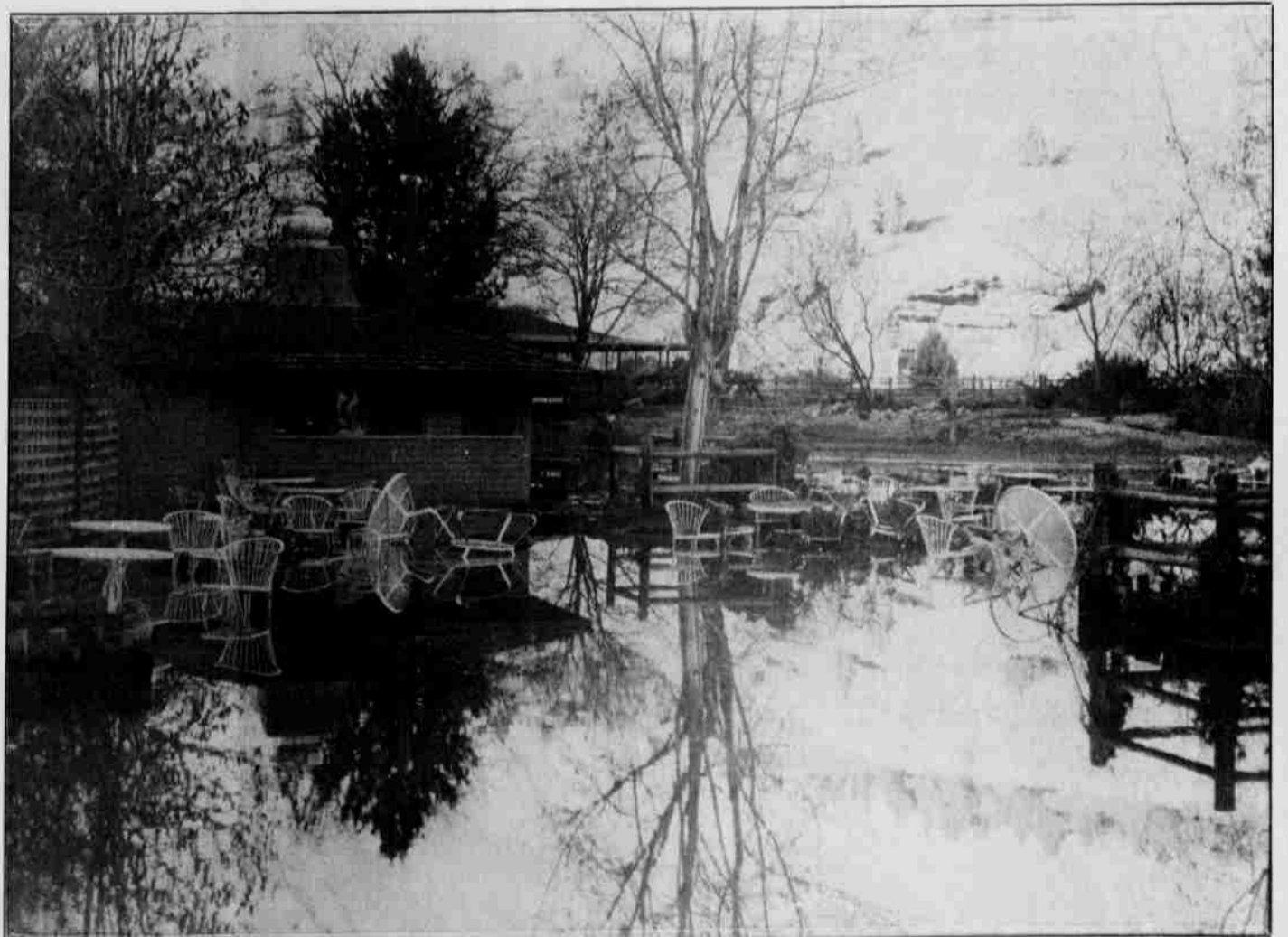
Village patio was reflective after the high water.