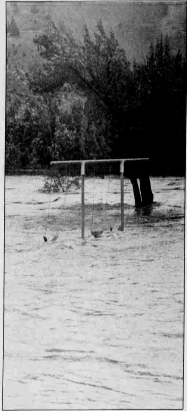
The river licks the bottom of the swings at Kah-Nee-Ta