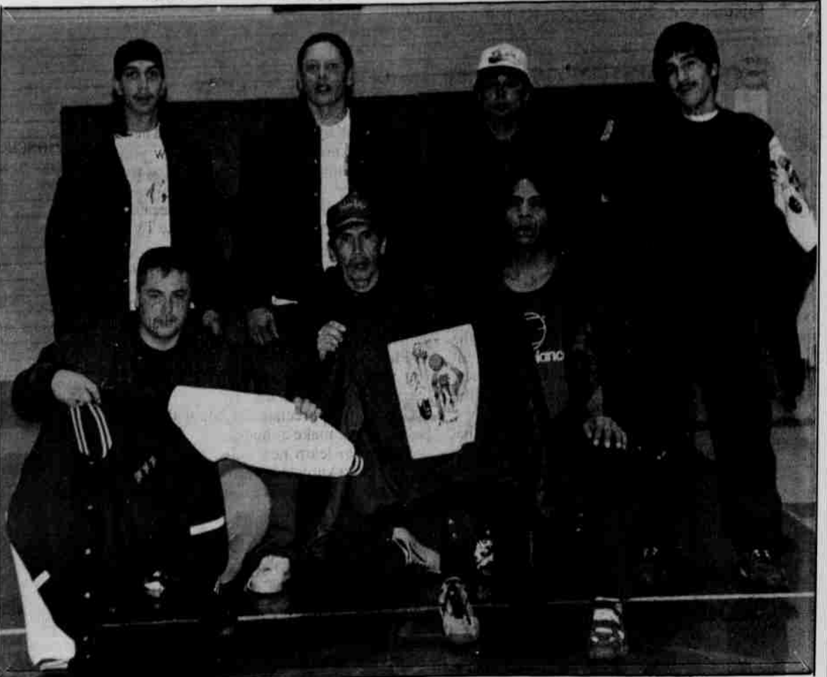
The Yakima Redmen show the leathersleeve championship jackets won in the Second Annual Eagle Spirits Men's Six Foot and Under Tournament held January 12-14, at the Warm Springs Community Center.