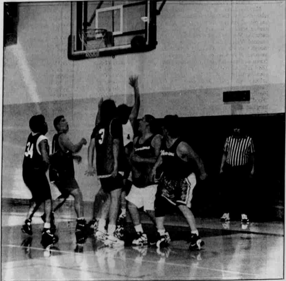
All five Schurz, Nevada players surround the Northwest Chiefs' player hoping to get the rebound. Schurz won third place beating out the Northwest Chief.

The Madras girls next game will be Saturday night here in the Buffalo Dome, with game time at 7:30 p.m.