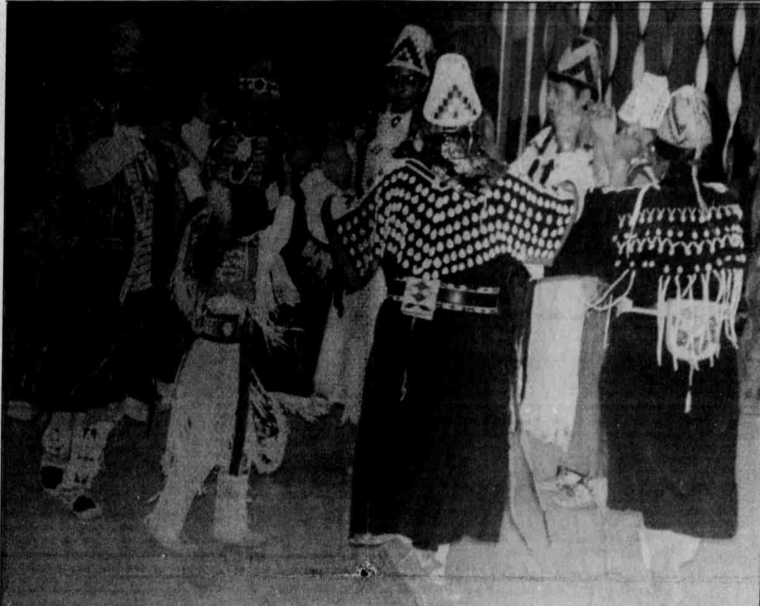
Local ladies do the Willow Dance as an exhibition dance while contestants ready themselves for the next category in the Miss Warm Pageant.

Have money problems? Set limits on your spending and aim to be debt-free. Self-discipline is necessary when curbing spending. 7