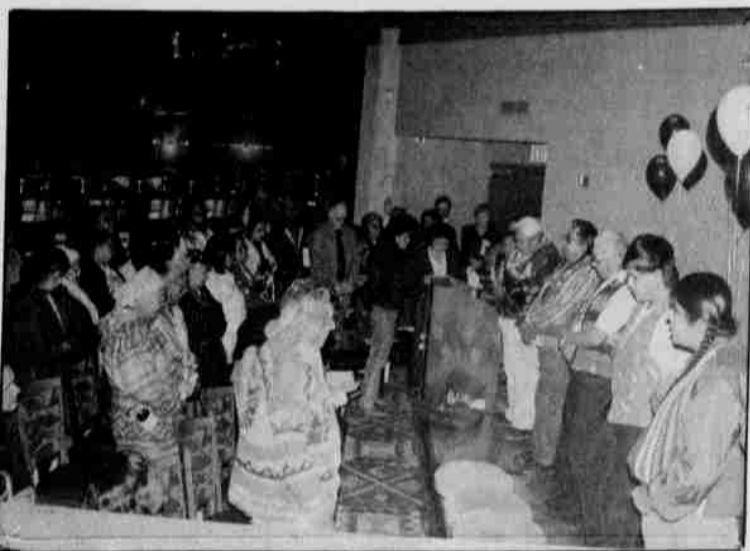
The blessing ceremony officially opened the Indian Head Gaming facility on December 4, 1995 during the "soft opening".