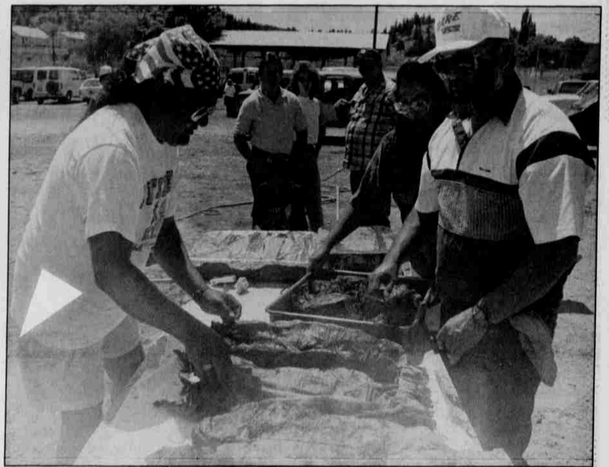
The 4th of July picnic brought back the barbeque bear and elk for many visitors.