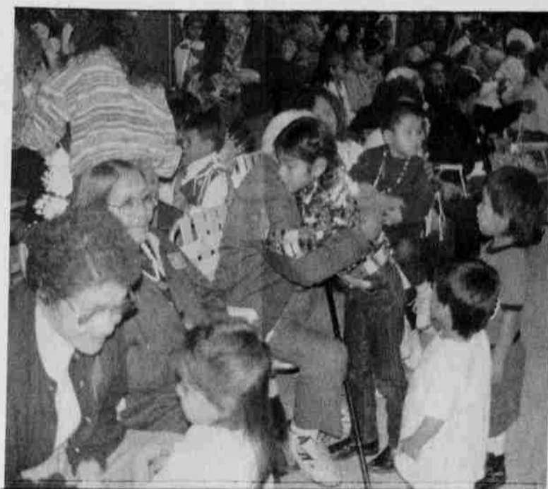
The Early Childhood Education Center children shared a hug and/or hand shake to the elders at the "Honor Elders Day".