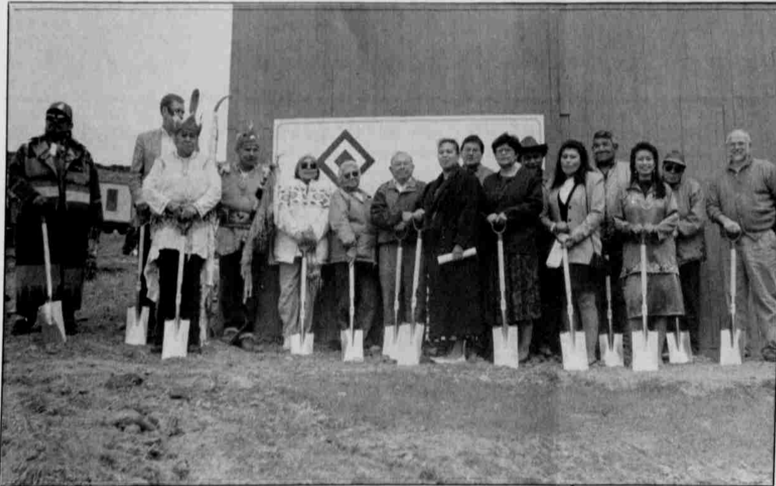
Tribal Council, Gaming Commissioners and director had the honors of the ground breaking of the Indian Head Gaming facility next to the Kah-Nee-Ta Lodge on April 7, 1995.