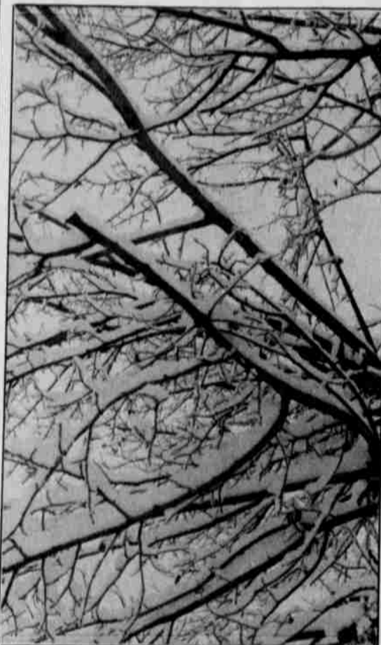
Branches collect snow