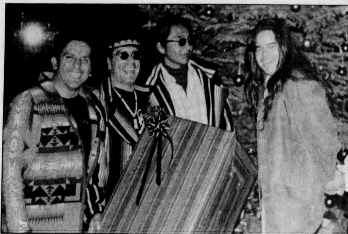
Native rock group Red Thunder stopped overnight at Kah-Nee-Ta Resort November 29 while on tour with the Blues Travelers. The group appeared in Portland, Seattle and Vancouver, B.C. and will eventually return to their Southwest home later this month. While at Kah-Nee-Ta, the group performed live on KWSO.