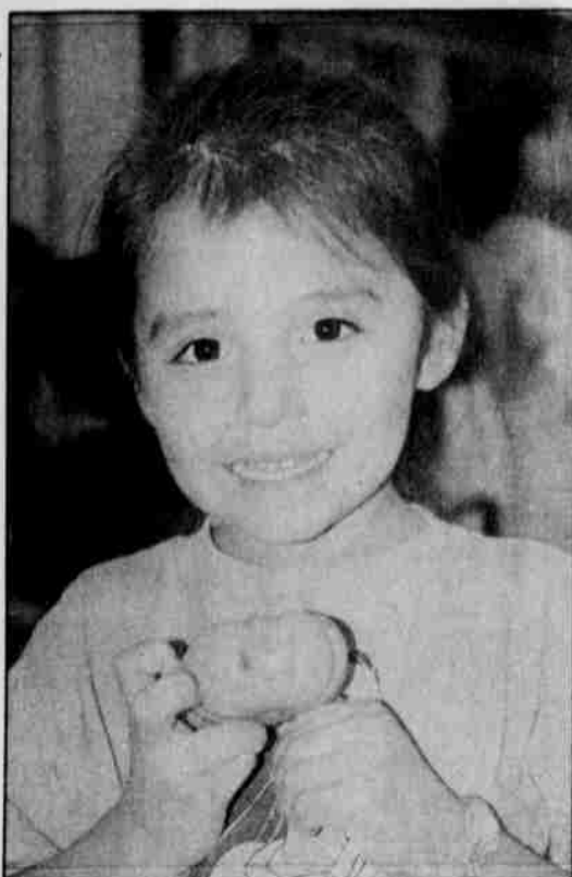
See my pumpkin?