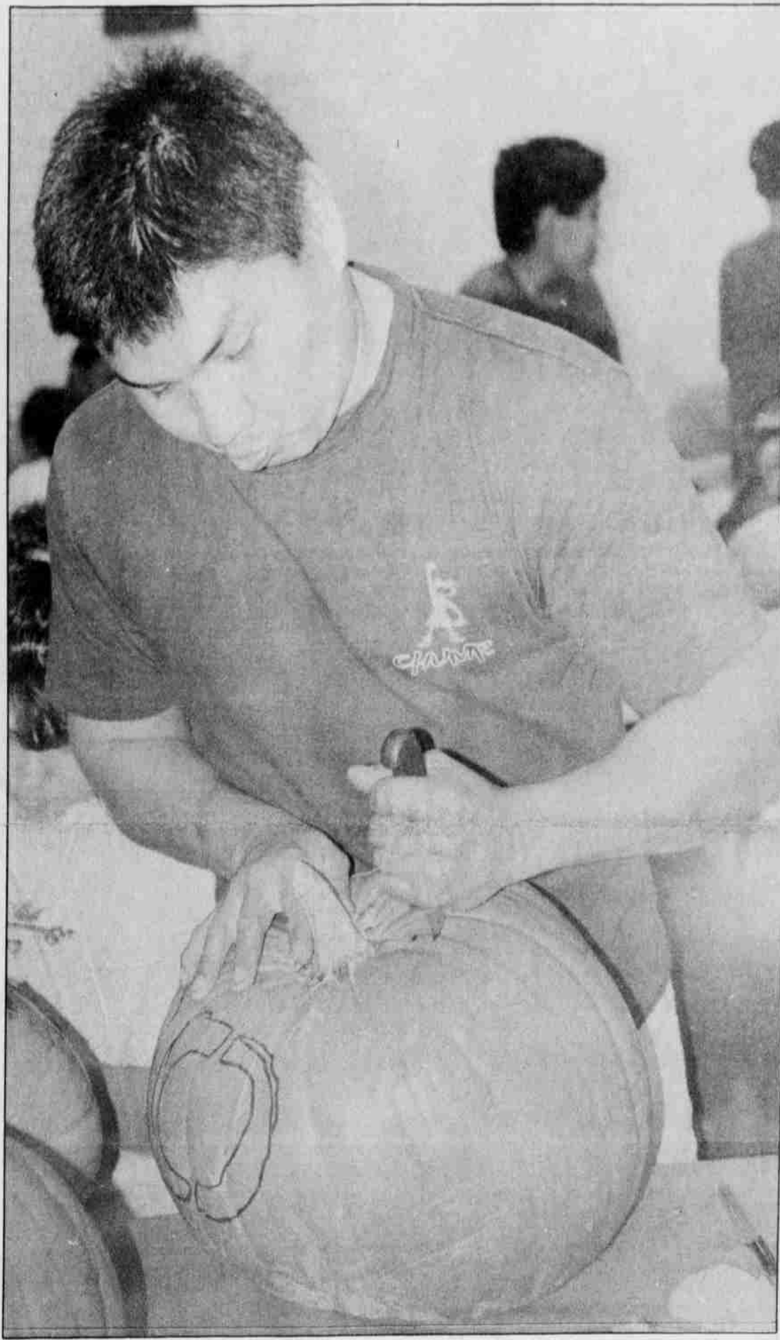
Carving requires hand/mouth coordination