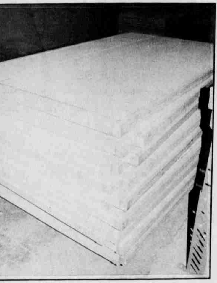
Fire door component finished product.