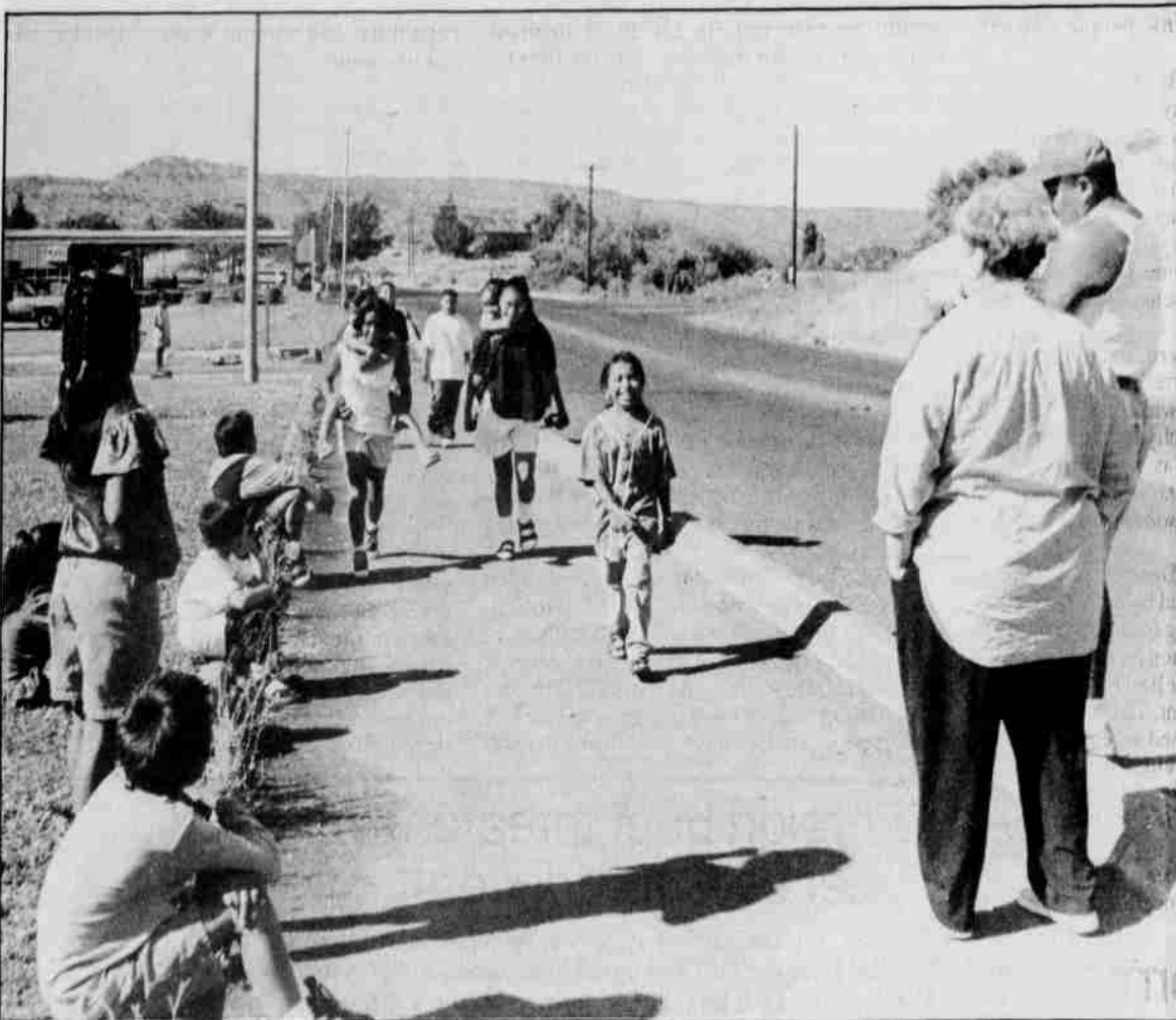
Recreation youth staff and children about to cross the finish line.

The Annual Summer Recreation Program "Summer End Fun Run—1.4 miles" was held Tuesday, August 7, 9:00 a.m. in front of the Community Center. A total of youth participated in this event, results are as follows: