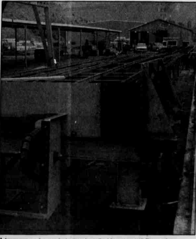
A temporary planer chain was installed for use until December.