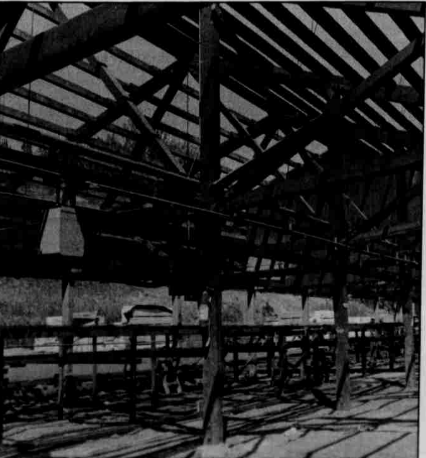
The roof that sheltered the planer was torn down to be replaced with a new building.