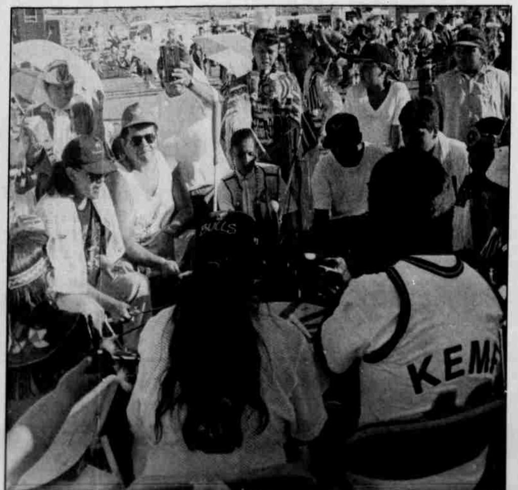
Eagle Spirit Drum was popular at this year's powwow.