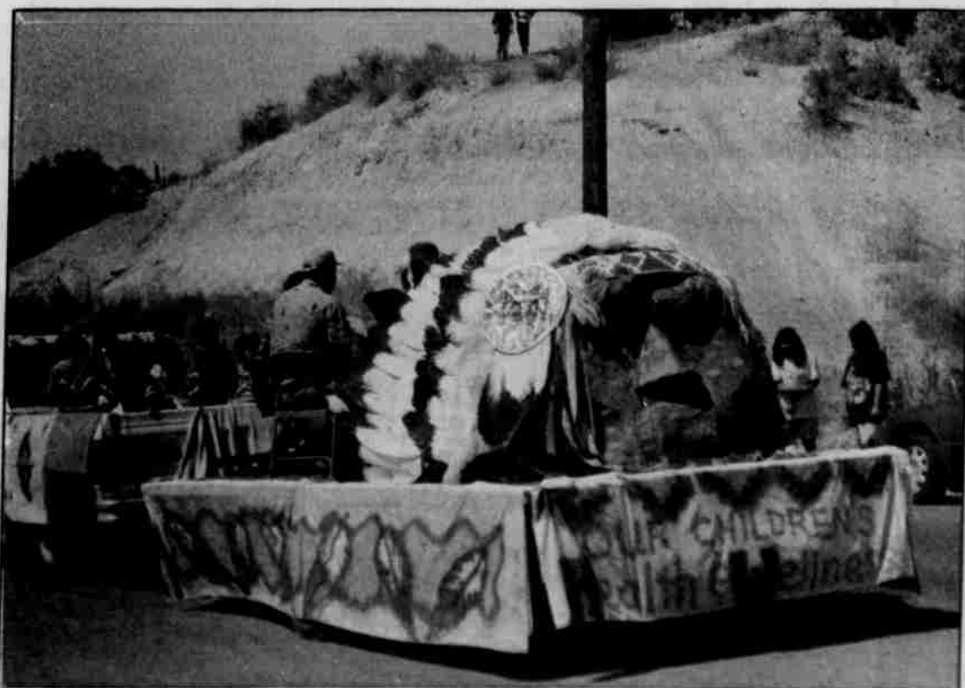
The Health and Wellness Center entered an impressive float.