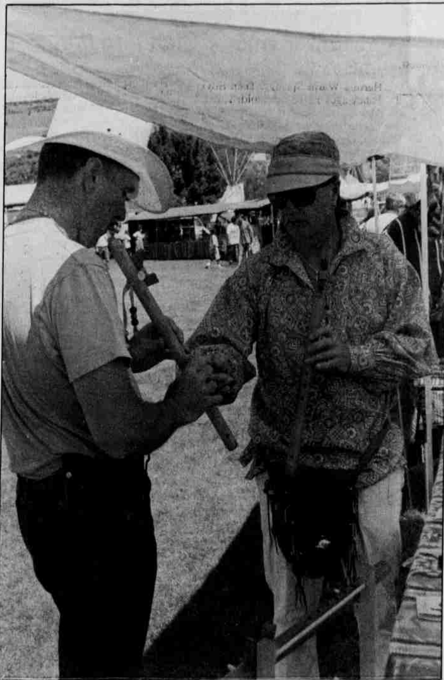
"Put your fingers here..."