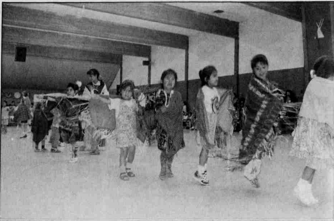
Very young ladies display the Butterfly Dance at the Warm Springs Early Childhood Center's End of the year pow wow at the Agency Longhouse Friday, June 2.

There will be openings in the Infant Center Toddler area beginning July 5th. The Child must be one year old or before September 1, 1995. Interested persons may pick up a registration packet at the front desk at ECE. The child will need a physical before they begin. Payment is $200 per month and there must be no past due child care bills or outstanding accounts from any previous Early Childhood Education service.