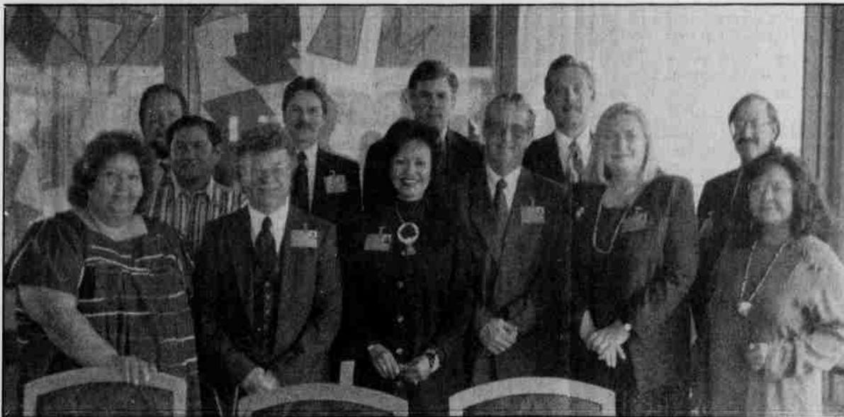
A well-qualified management team has been hired at Indian Head Gaming.