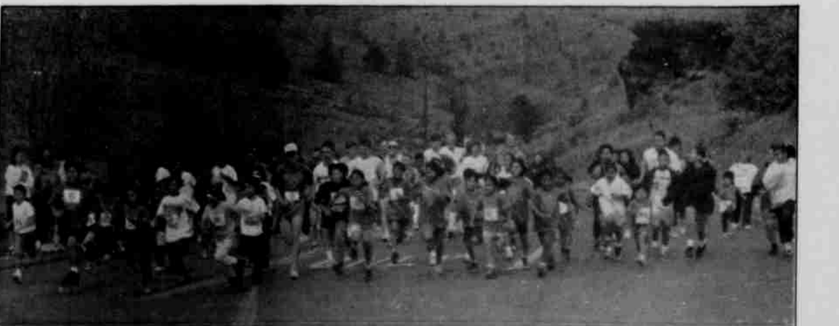
A total of 89 runners at the starting line for the 10K, 3.0 mile and 1.0 mile fun run walk.