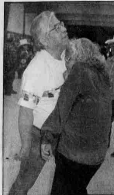
Going . . .