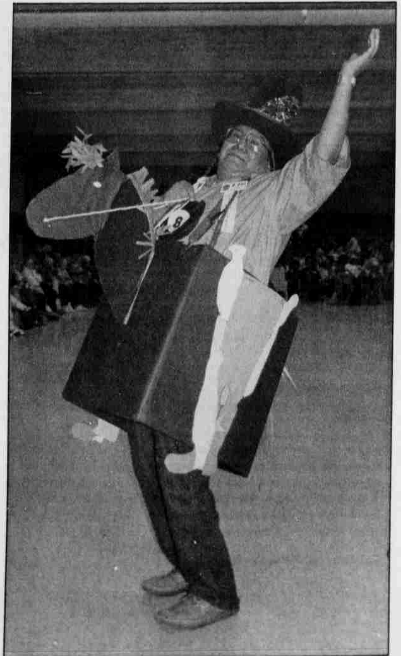
Eight ball was the M.C., he stopped his horse long enough for a photo.