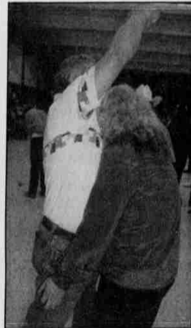
going . . .