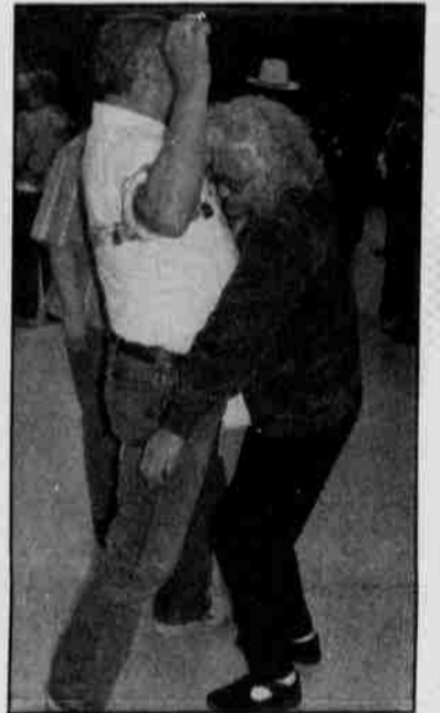
gone . . .