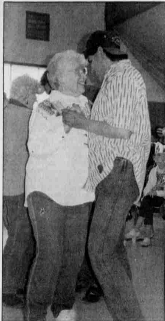
Add an orange and you have a fun owl dance.

More than 700 Senior Citizens visited Warm Springs for the 1995 Honor Seniors Day held March 17, 1995 at the Agency Longhouse.