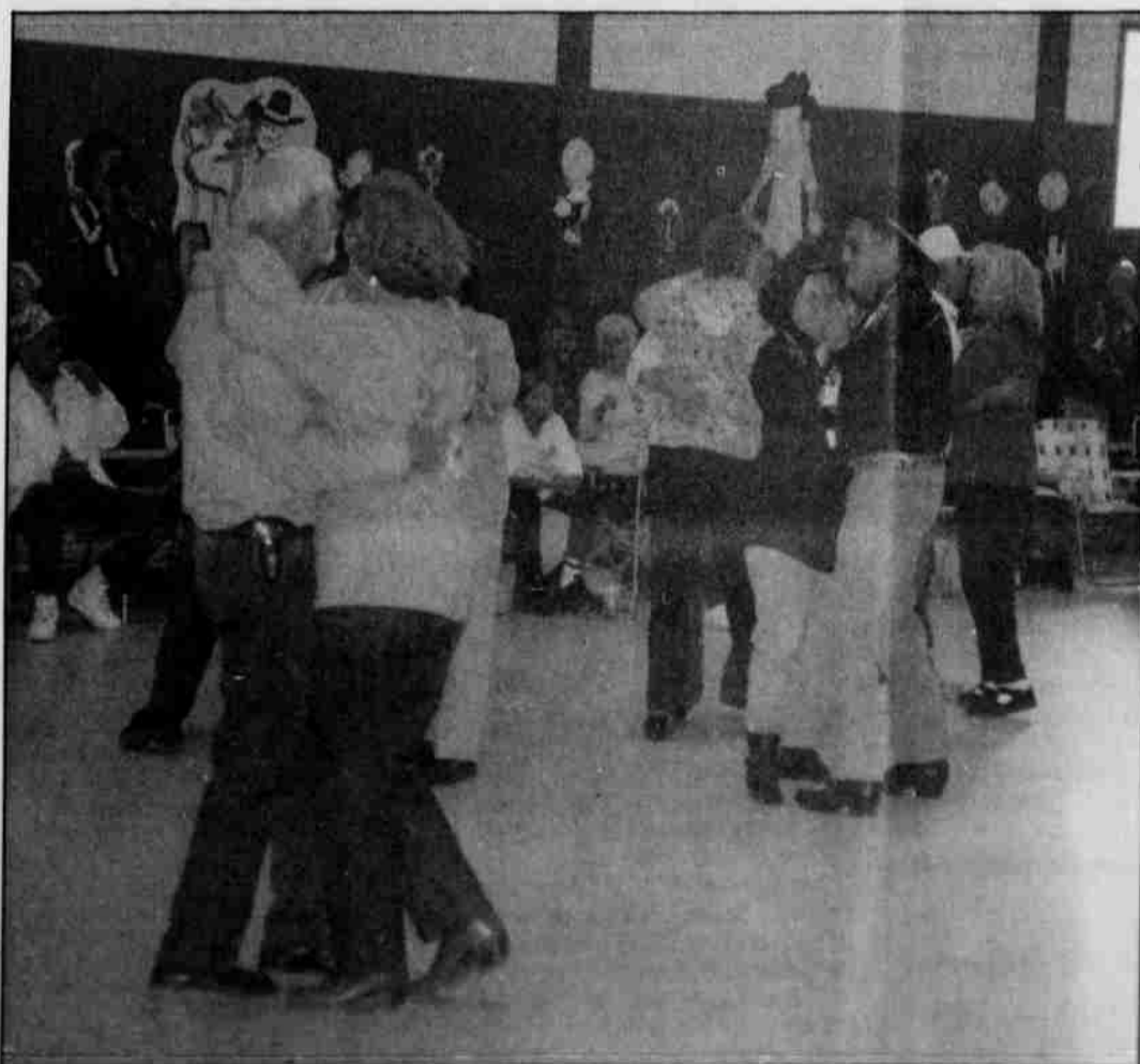
Married couples remembered their younger days of dancing to soft music.