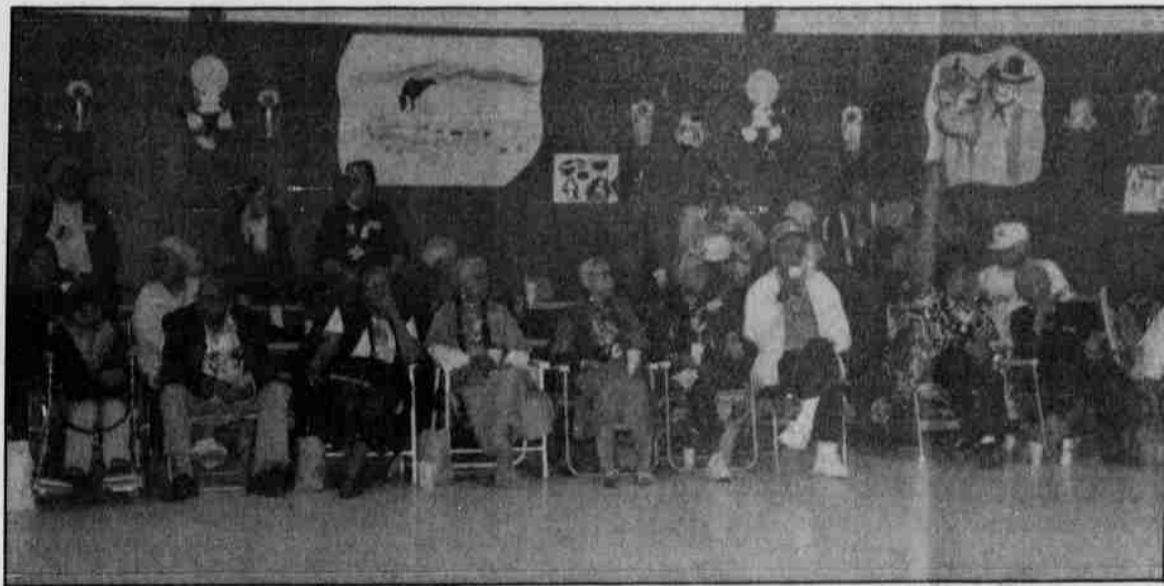
Senior citizens from various neighboring states traveled to Warm Springs for this fun-filled event.