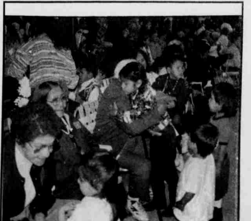
Seniors Citizens received special attention from the children during the morning powwow. Each child from ECE gave something special to one Senior Citizen, then they either gave them a hug or a hand shake. See related photos on page 3.

This year's conference theme is "Students Today, Warriors of Tomorrow". The Oregon Indian Education Association (OIEA) is a statewide organization dedicated to promoting quality educational services for American Indian people in the State of Oregon. Planners expect 400-500 people to participate in the conference.