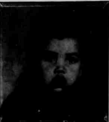
Happy Birthday Son Love, Mom & Dad