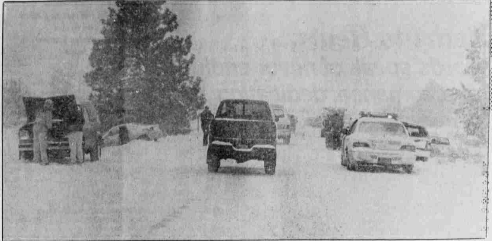
Winter revisited Sunday, February 12 and made traveling hazardous, to say the least.