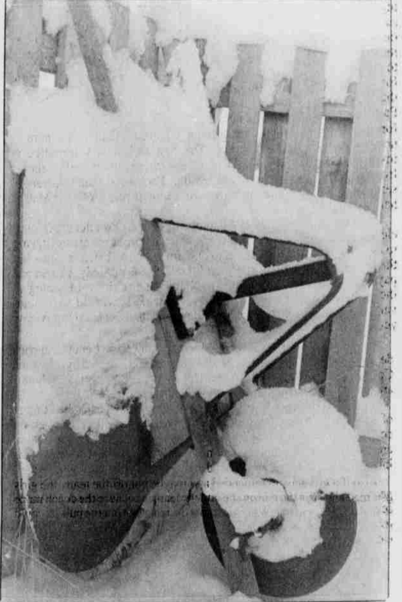
A wheel barrow appeared to be poised for anything but snow.