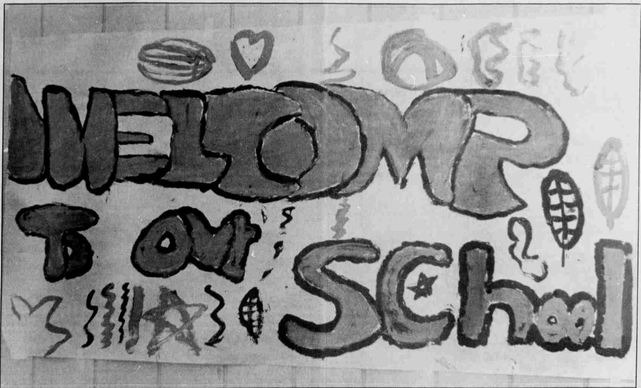
Simnasho students create sign to welcome visitors.