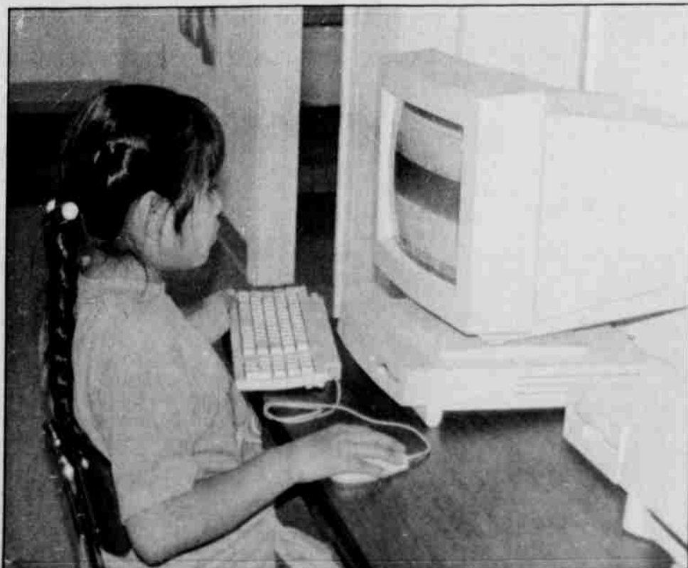
The computer is a favorite with the students, they "fight" over it.