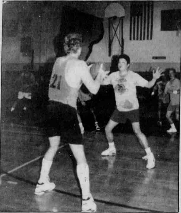
Pendleton playing defense against opponents, Saturday, January 14, during Eagle Spirits Basketball Tournament.