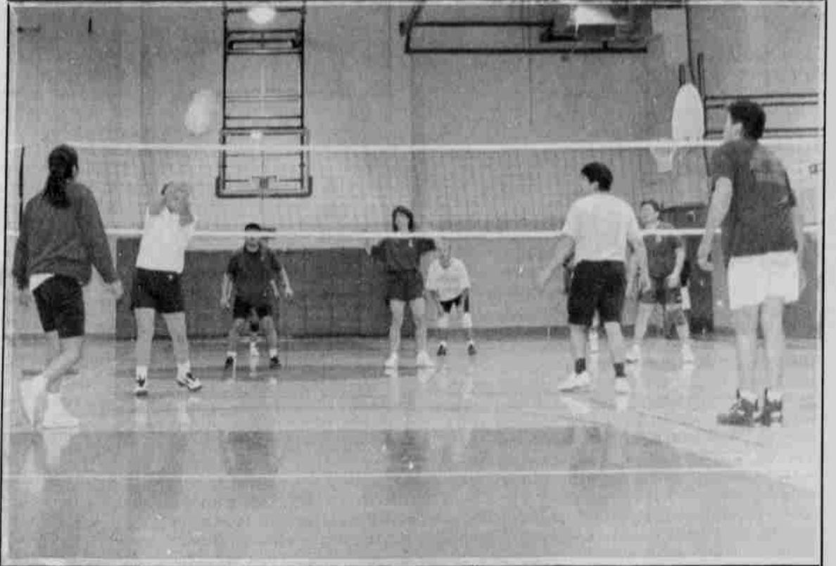
Championship game was long.....as Tribes I worked their way through the back door to win the memorial tourney.