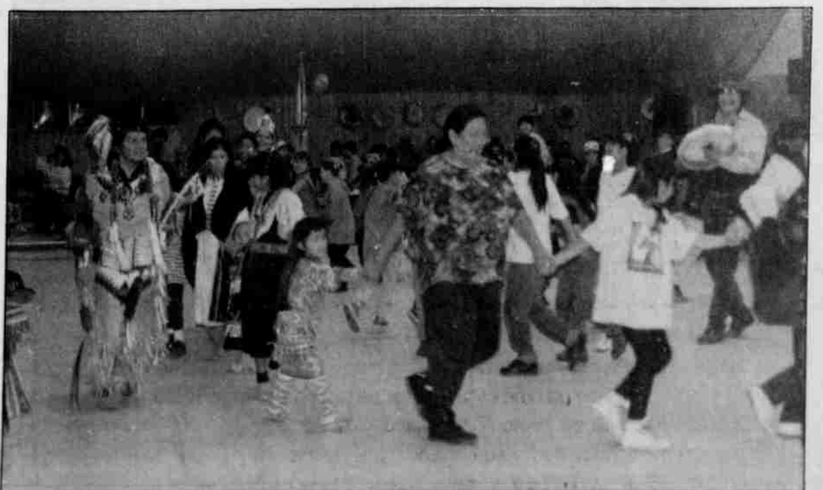
Children and parents enjoyed the dancing at the ECE Parents Nite Out. The last dance was the snake dance which brought many smiles to parents and children alike.