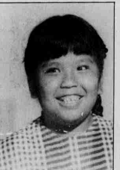
Happy belated Birthday Big Doll December 30