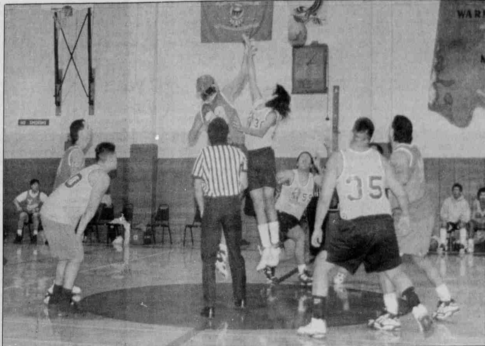
Opening game of the Holiday Tournaments was won by Santa Clara against the Warm Springs Gamers, 177-77.