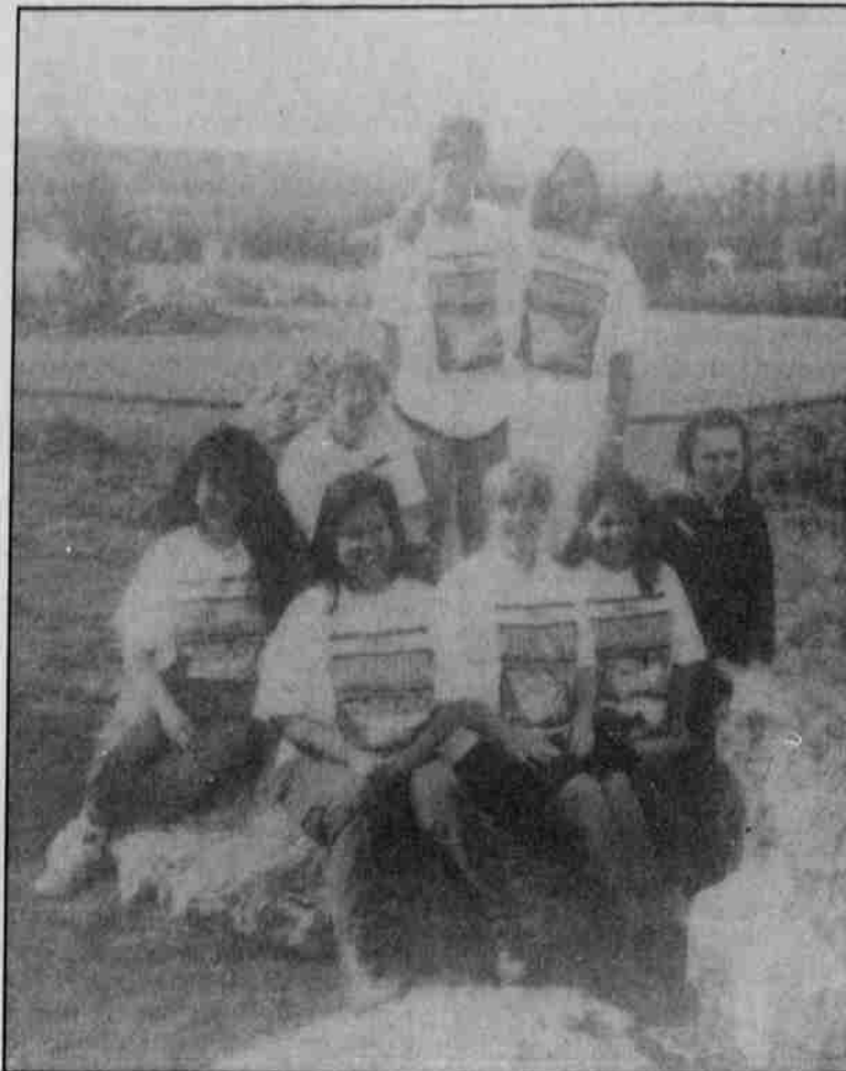
Eight members of the Health and Wellness Center staff joined the American Diabetes Association's Walktoberfest in Bend on October 1. The purpose of the 8-mile walk was to raise money through pledges. The Warm Springs team raised a total of $661!

The money raised by the Walktoberfest goes toward diabetes care and research, such as the study on diabetic retinopathy conducted by the Oregon Health Sciences University (OHSU). Other projects funded by the money raised from the walk include the Oregon Commission for the Blind program to assist newly blinded people learn adaptive diabetes management skills, and the St. Charles Medical Center's program to provide community education about diabetes.