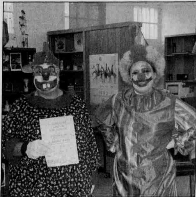
Clowns announced the Carnival early in the week prior to the event.