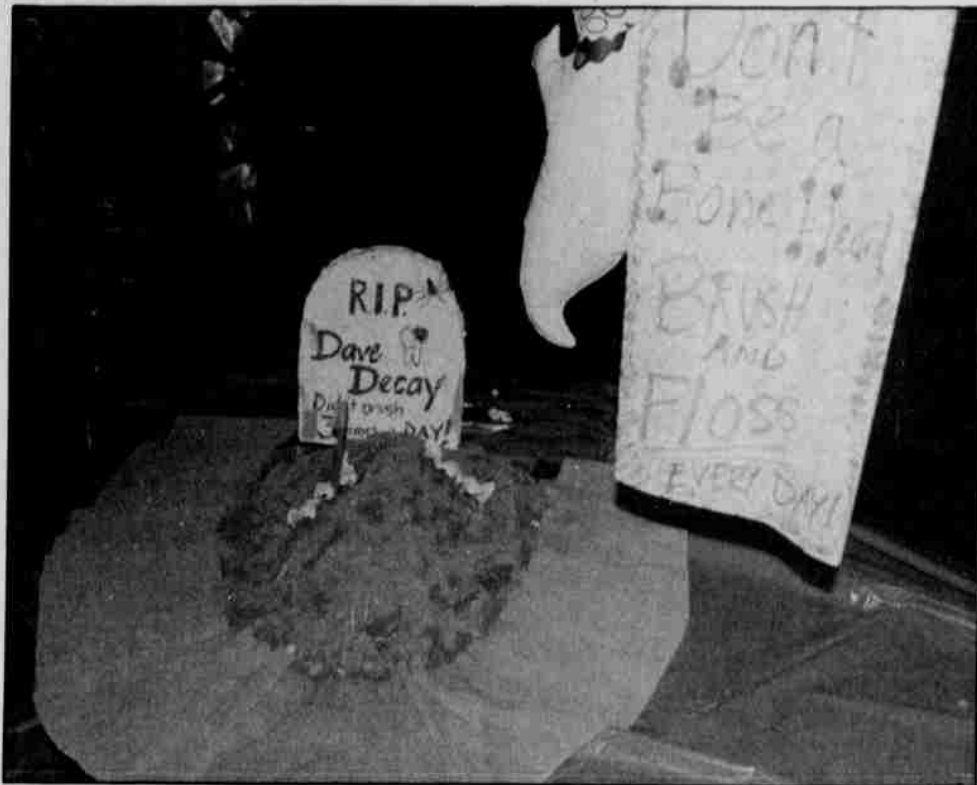
The Indian Health Service dental staff prepared a haunted house which encouraged improved dental care.

A Saturday event at the Center introduces community members to ways to improve overall health and well-being