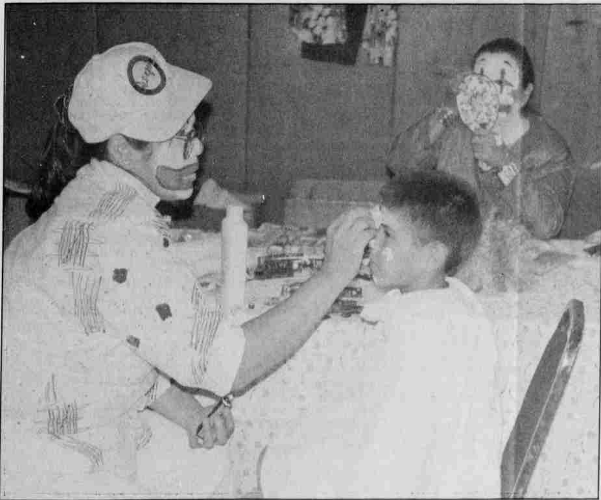
Clowning around, a youngster gets a new face for the day.