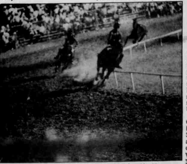
After one lap of the Indian Relay race a riderless horse is making his move on the pack. All the races were crowd pleasers all through the Round-Up.

Another exciting performance is now in the past as everyone will be looking forward to the next one during the coming year.