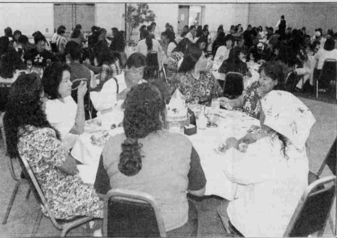
A luncheon was held at Kah-Nee-Ta Lodge August 11 to celebrate another successful year for the Summer Work Program. The program employed 121 youth in numerous tribal departments and enterprises. Nearly 30 students were nominated by their respective departments as outstanding workers.

There are still things that need to finish out; junior council election, the master calendar, the end of the program evaluation, which includes: exit interviews, report card on employers, reviewing the process and services and completing a written report. Until the next REZ RAPPENINGS news, be safe and don't worry.