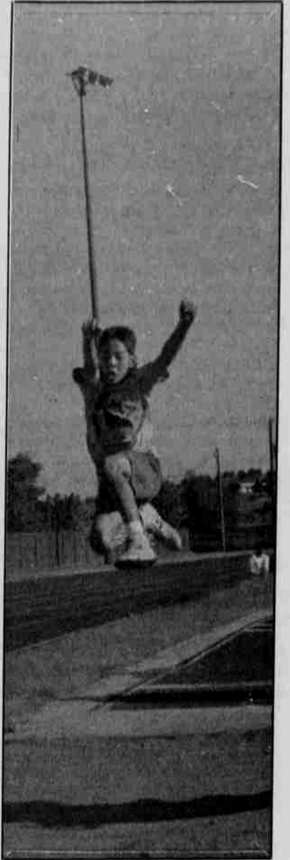
The long jump attracted many.