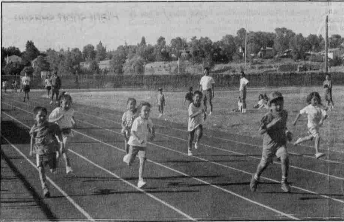
Six to eight year olds race the finish line in the 50 yard dash event.