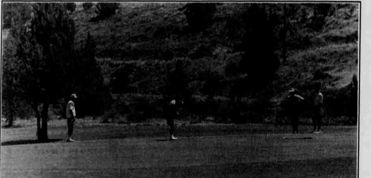
Sunday, June 26, 1994 golfers from everywhere were finishing their course at the annual Fry Bread Open held at Kah-Nee-Ta Resort as part of the Pi-Ume-Sha celebration.