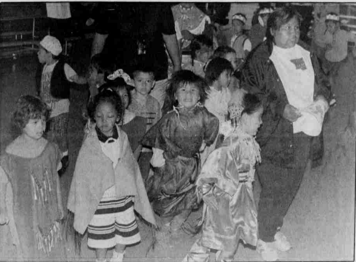
The end of the year powwow for the Warm Springs Early Childhood Education Center was Wednesday, June 1, at the Agency Longhouse, followed by a picnic.